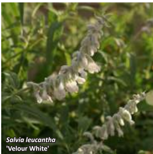
Salvia leucantha 'Velour White'