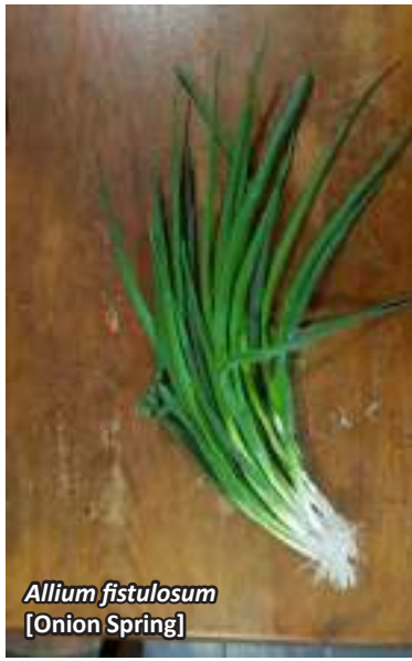
Allium fistulosum [Onion Spring]