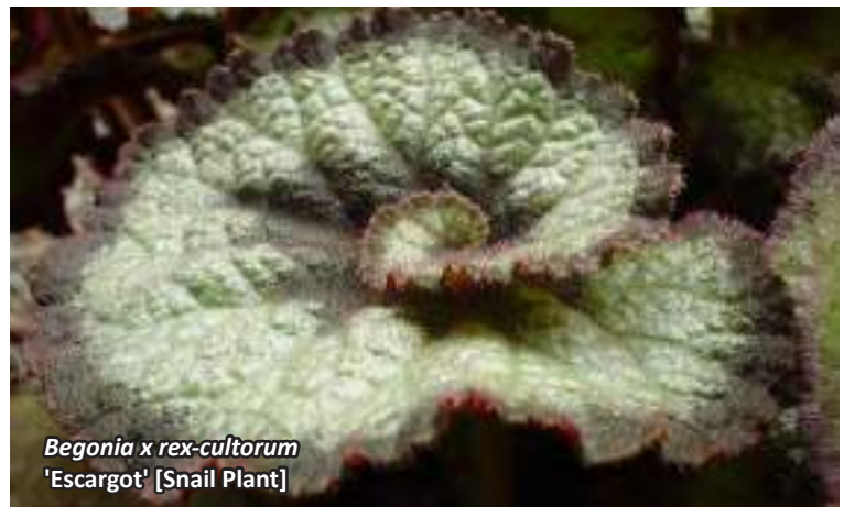
Begonia x rex-cultorum 'Escargot' [Snail Plant]