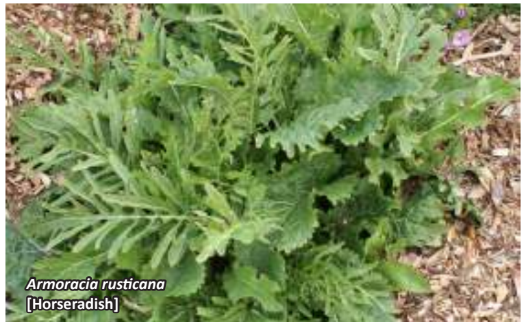
Armoracia rusticana [Horseradish]