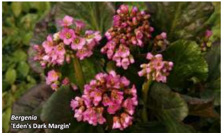
Bergenia 'Eden's Dark Margin'