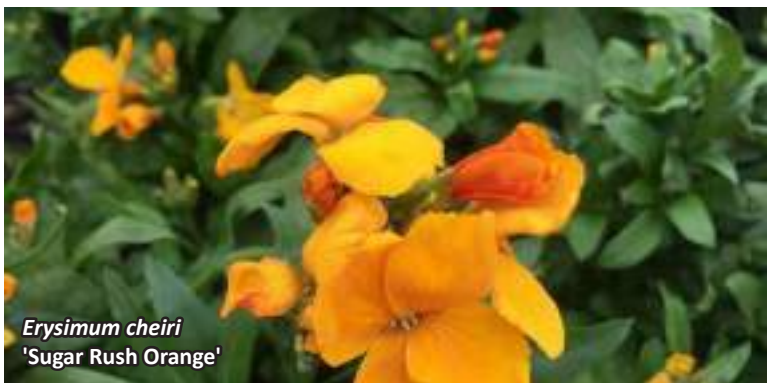
Erysimum cheiri 'Sugar Rush Orange'