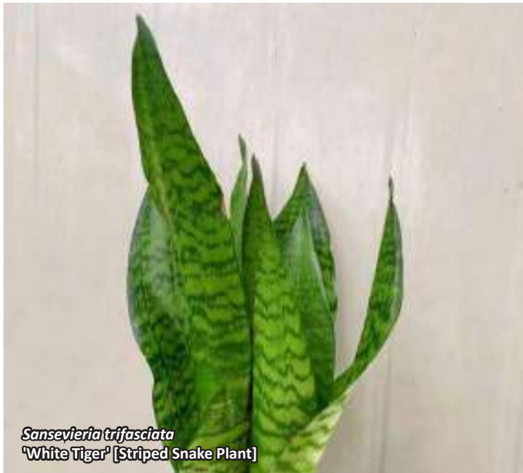
Sansevieria trifasciata 'White Tiger' [Striped Snake Plant]