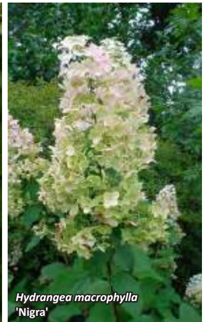
Hydrangea macrophylla 'Nigra'