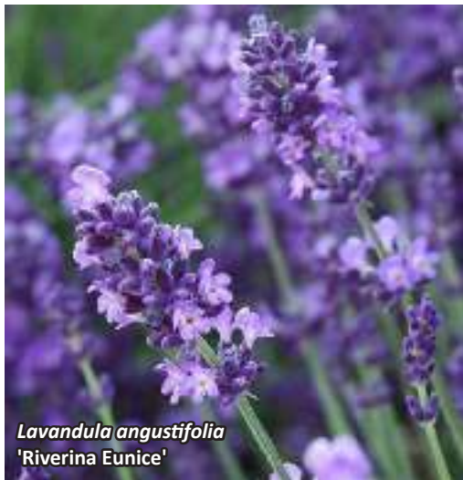
Lavandula angustifolia 'Riverina Eunice'