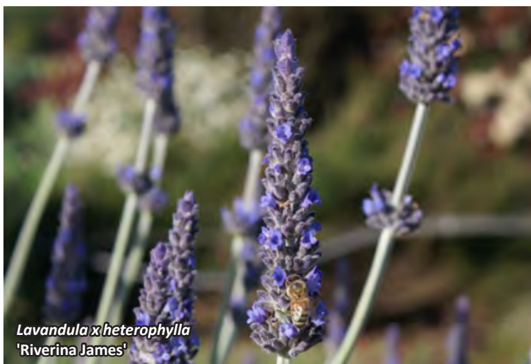
Lavandula x heterophylla 'Riverina James'