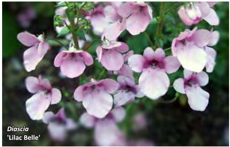
Diascia 'Lilac Belle'