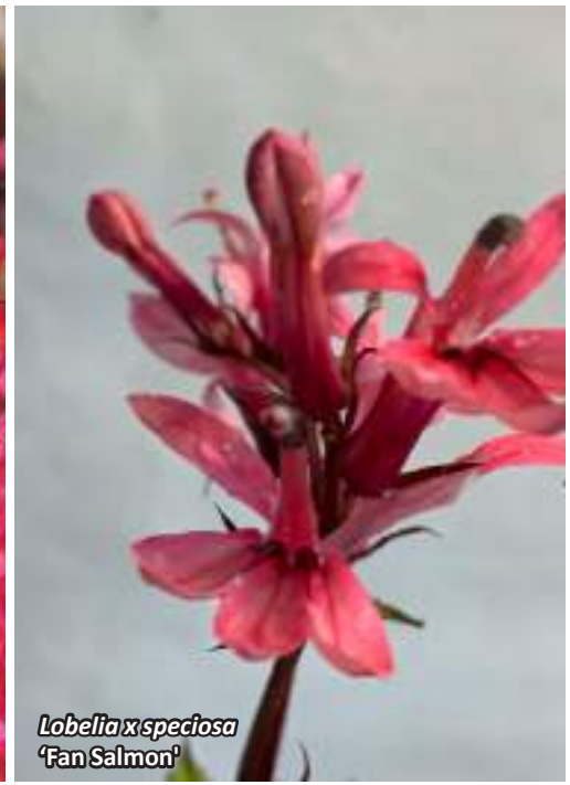
Lobelia x speciosa 'Fan Salmon'