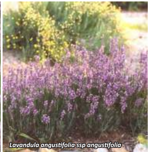
Lavandula angustifolia ssp angustifolia