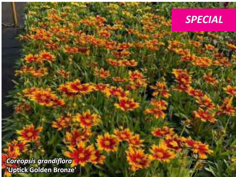
Coreopsis grandiflora 'Uptick Golden Bronze'