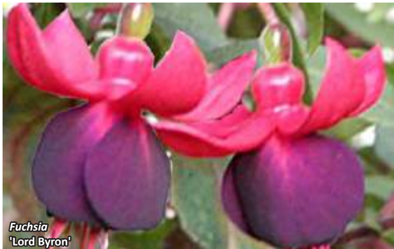
Fuchsia 'Lord Byron'