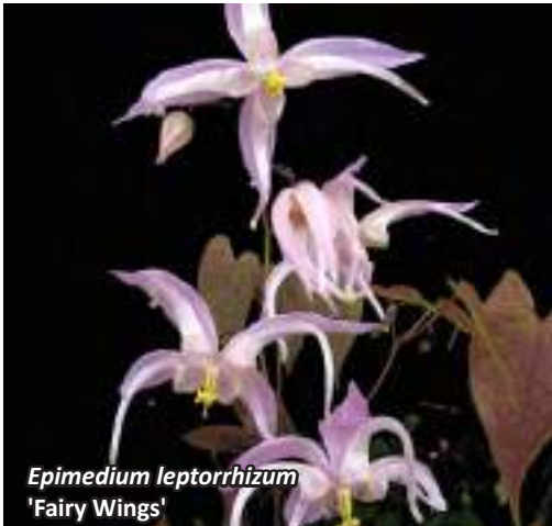
Epimedium leptorrhizum 'Fairy Wings'