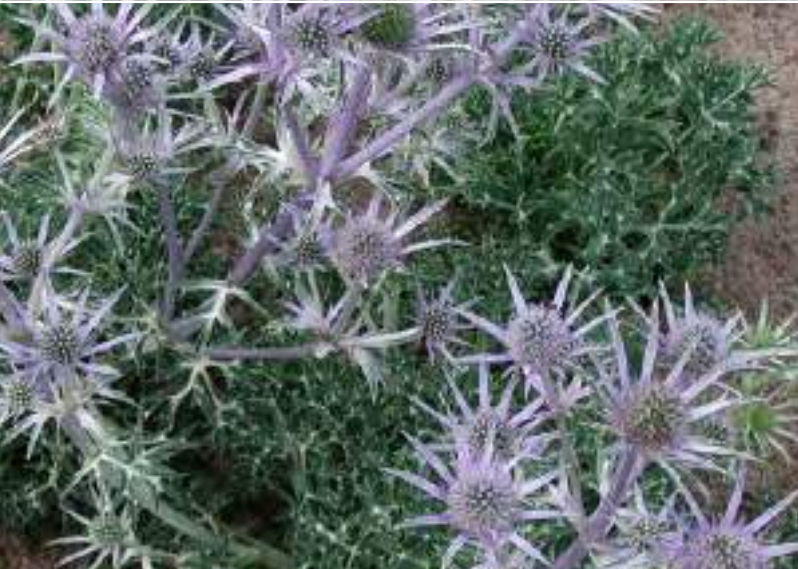
Eryngium x zabelli 'Pen Blue'