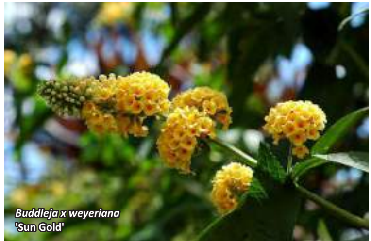
Buddleja x weyeriana 'Sun Gold'