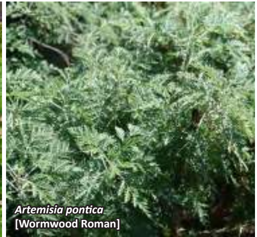
Artemisia pontica [Wormwood Roman]