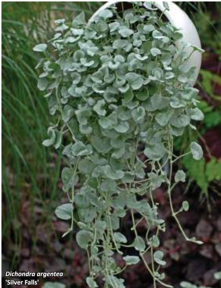
Dichondra argentea 'Silver Falls'