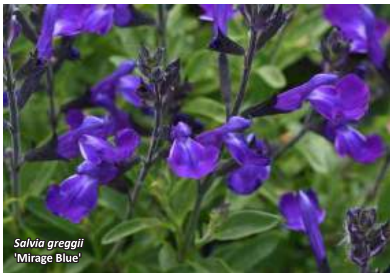
Salvia greggii 'Mirage Blue'