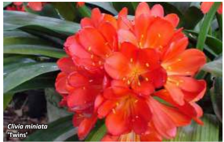
Clivia miniata 'Twins'