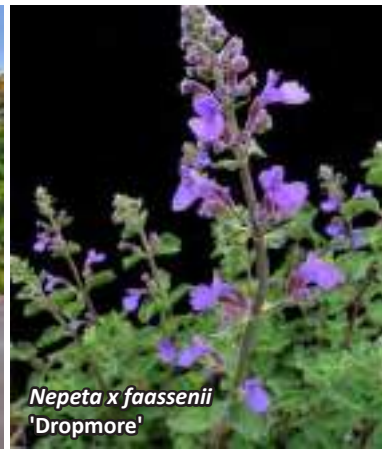
Nepeta x faassenii 'Dropmore'