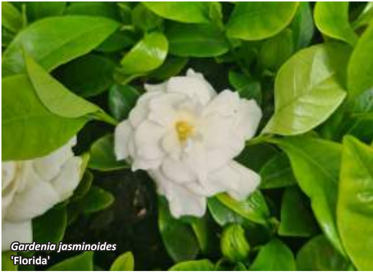
Gardenia jasminoides 'Florida'