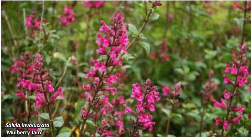
Salvia involucrata 'Mulberry Jam'