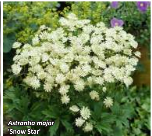
Astrantia major 'Snow Star'