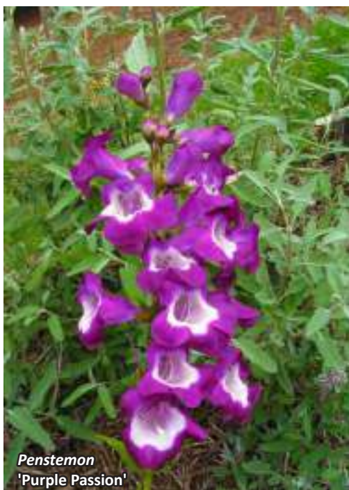
Penstemon 'Purple Passion'