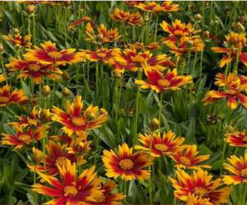
Coreopsis grandiflora 'Uptick Golden Bronze'