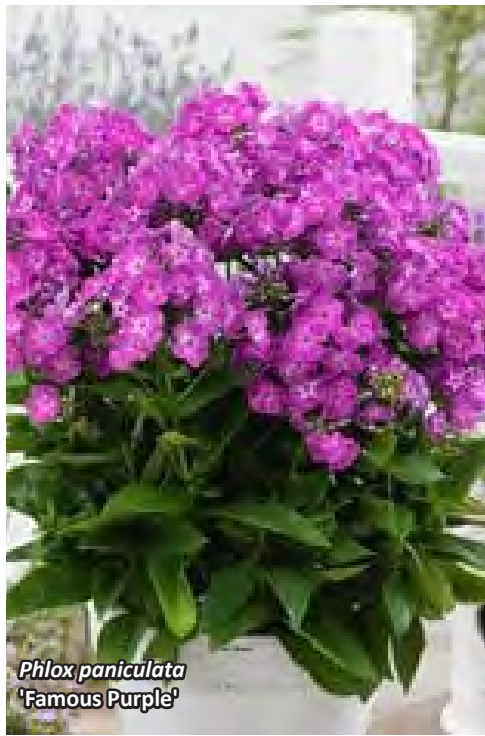
Phlox paniculata 'Famous Purple'