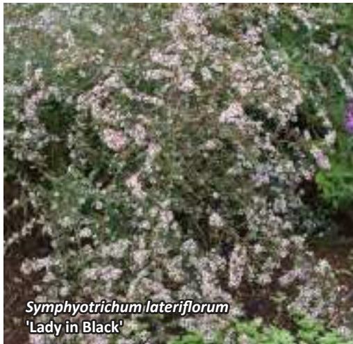
Symphotrichum lateriflorum 'Lady in Black'