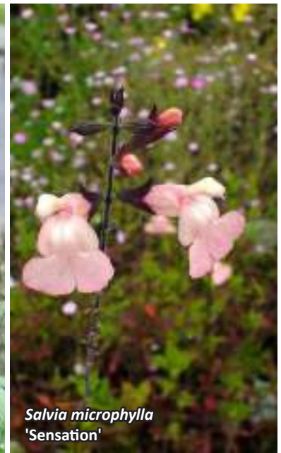
Salvia microphylla 'Sensation'