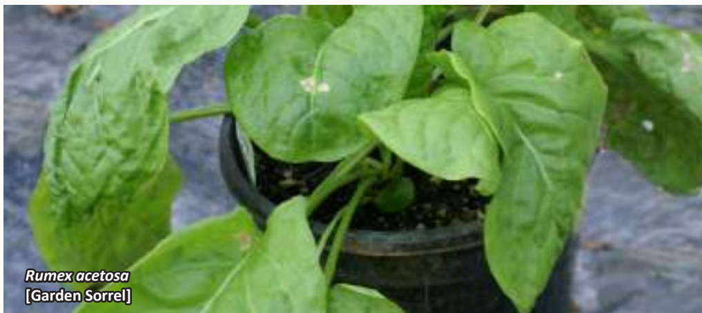
Rumex acetosa [Garden Sorrel]