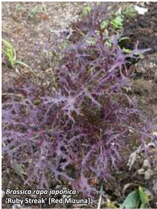
Brassica rapa japonica 'Ruby Streak' [Red Mizuna]