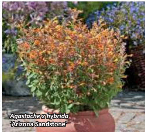
Agastache x hybrida 'Arizona Sandstone'