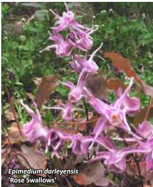
Epimedium darleyensis 'Rose Swallows'