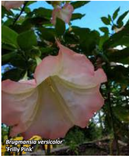
Brugmansia versicolor 'Filly Pink'