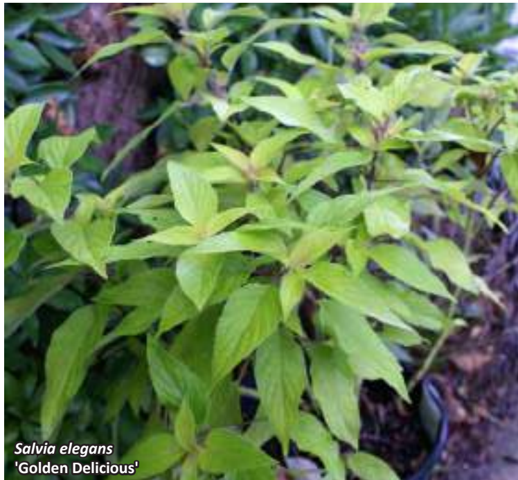
Salvia elegans 'Golden Delicious'