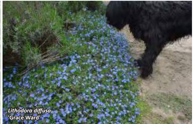
Lithodora diffusa 'Grace Ward'