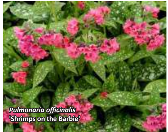
Pulmonaria officinalis 'Shrimps on the Barbie'