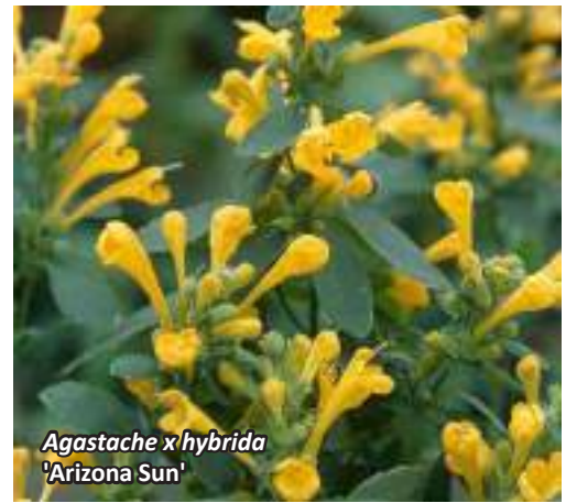
Agastache x hybrida 'Arizona Sun'