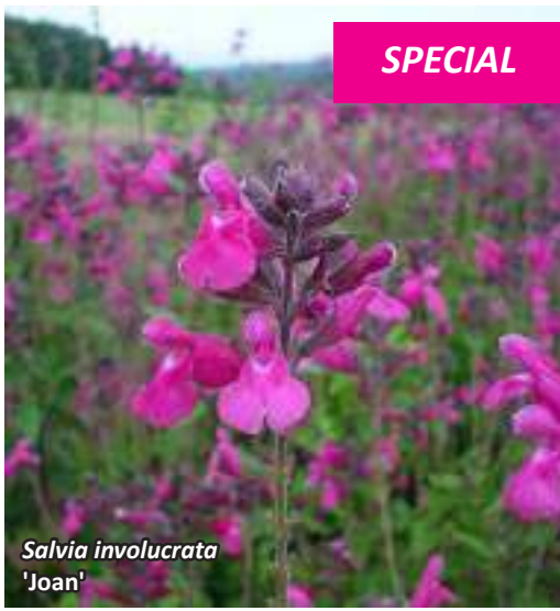
Salvia involucrata 'Joan'