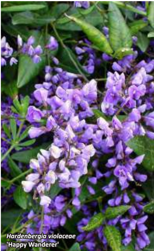
Hardenbergia violaceae 'Happy Wanderer'