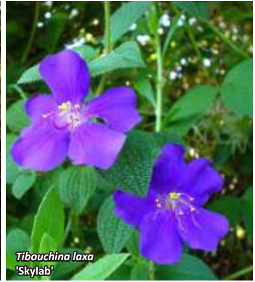
Tibouchina laxa 'Skylab'