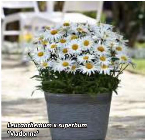
Leucanthemum x superbum 'Madonna'