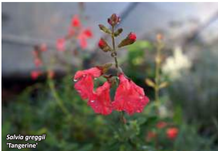
Salvia greggii 'Tangerine'