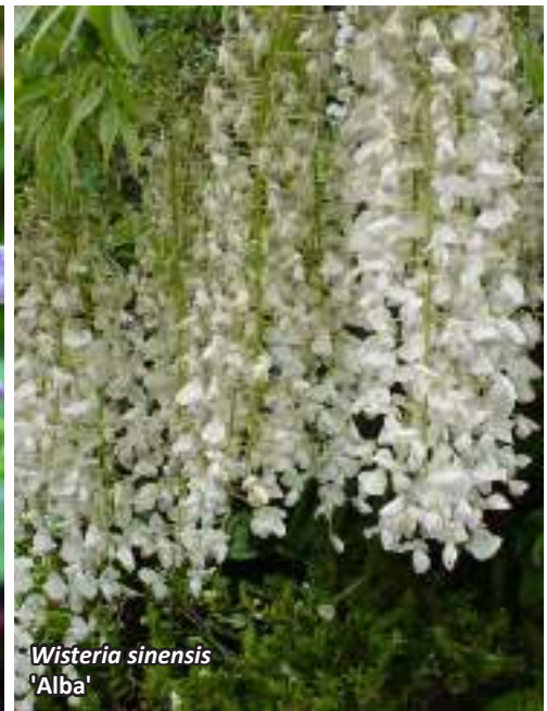
Wisteria sinensis 'Alba'