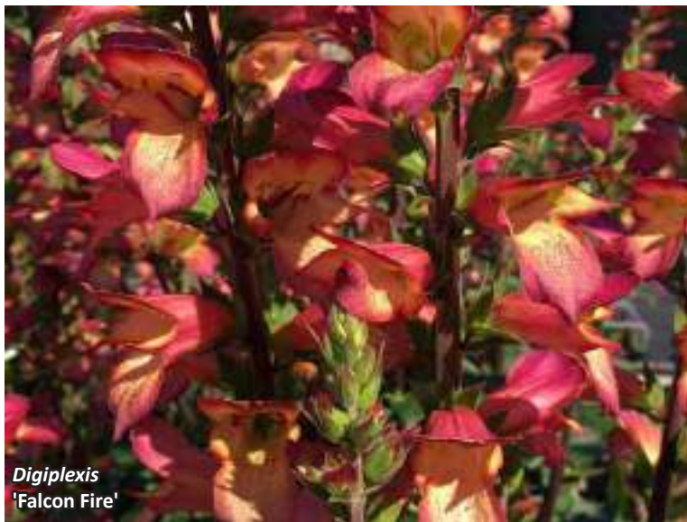
Digiplexis 'Falcon Fire'