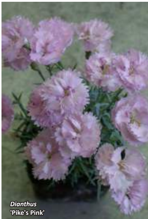
Dianthus 'Pike's Pink'