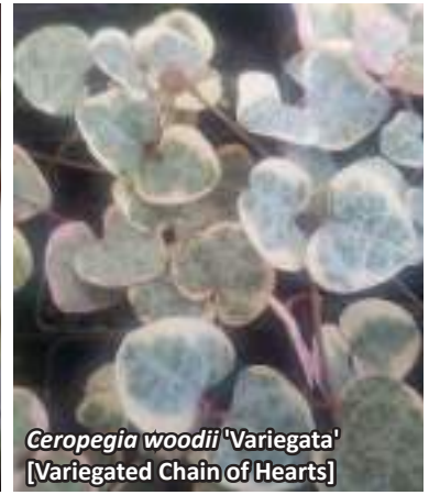
Ceropegia woodii 'Variegata' [Variegated Chain of Hearts]