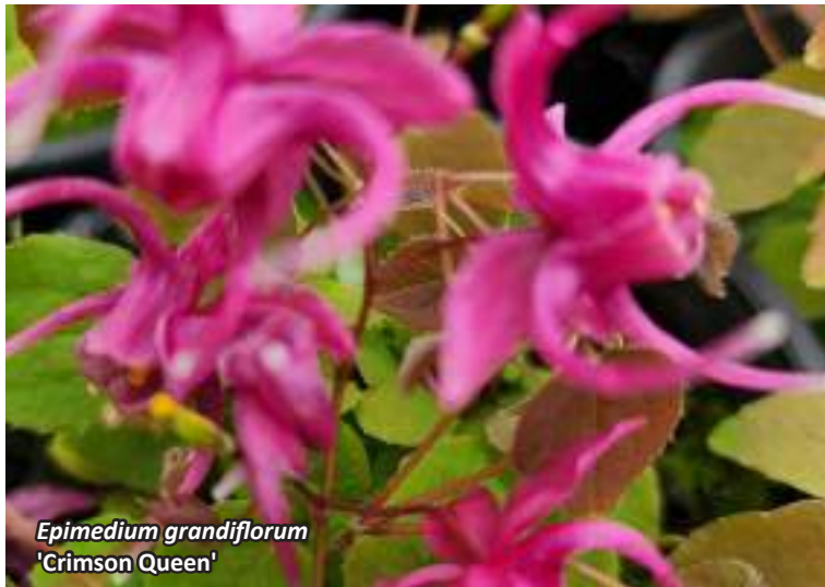
Epimedium grandiflorum 'Crimson Queen'