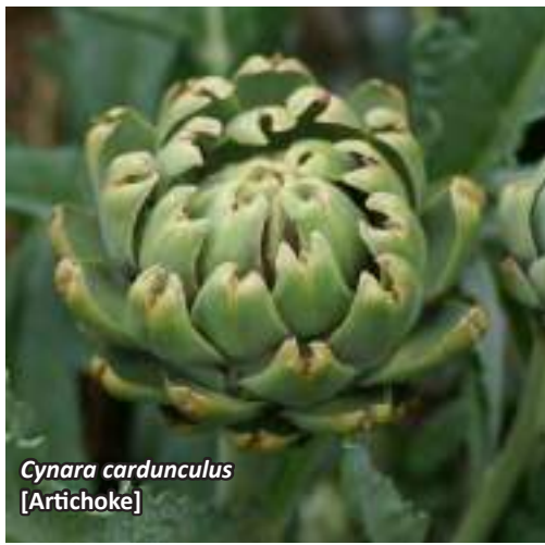
Cynara cardunculus [Artichoke]