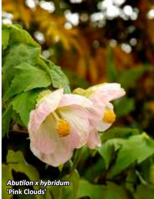
Abutilon x hybridum 'Pink Clouds'