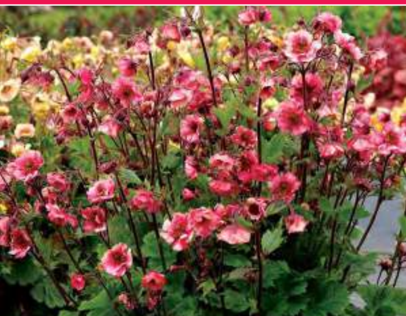
Geum 'Tempo Rose'