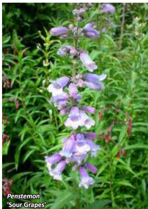
Penstemon 'Sour Grapes'