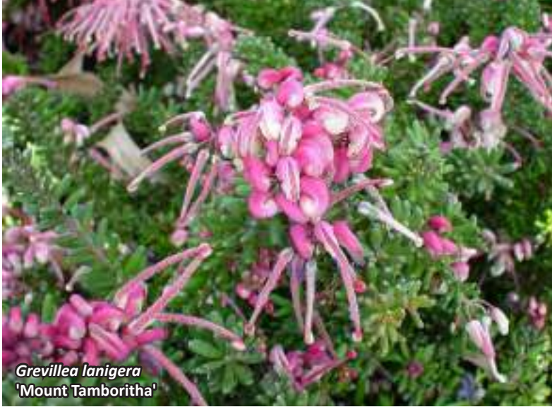
Grevillea lanigera 'Mount Tamboritha'