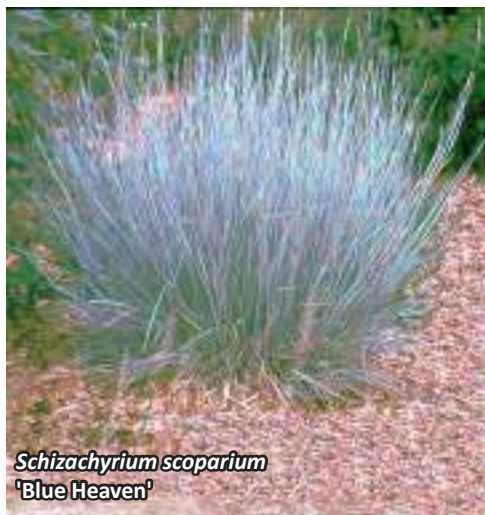
Schizachyrium scoparium 'Blue Heaven'