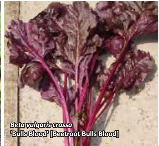
Beta vulgaris crassa 'Bulls Blood' [Beetroot Bulls Blood]