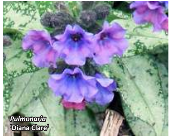
Pulmonaria 'Diana Clare'