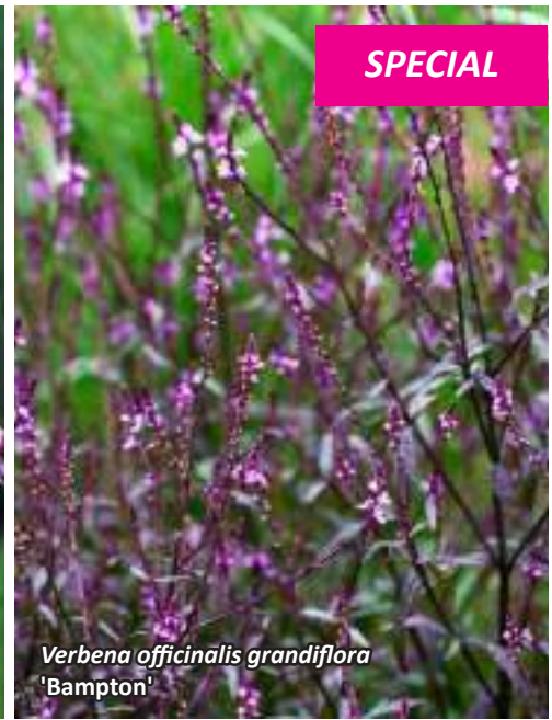
Verbena officinalis grandiflora 'Bampton'