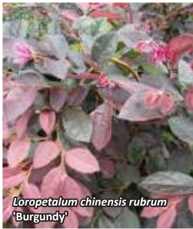
Loropetalum chinensis rubrum 'Burgundy'