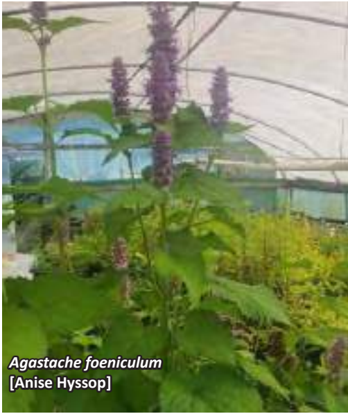
Agastache foeniculum [Anise Hyssop]