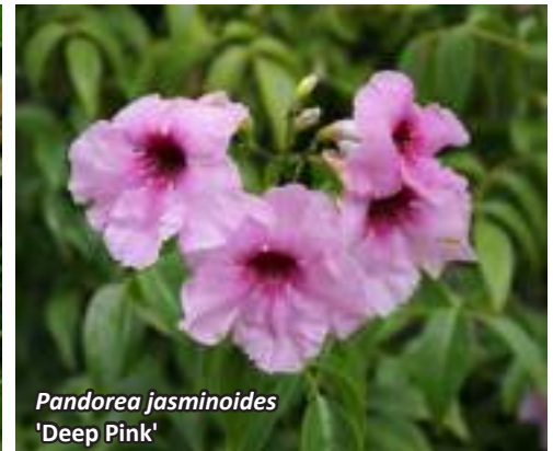
Pandorea jasminoides 'Deep Pink'