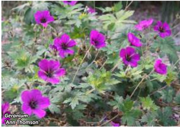
Geranium 'Ann Thomson'