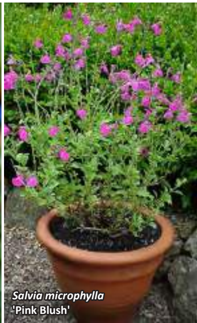
Salvia microphylla 'Pink Blush'