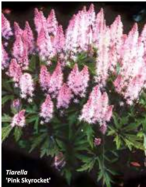
Tiarella 'Pink Skyrocket'