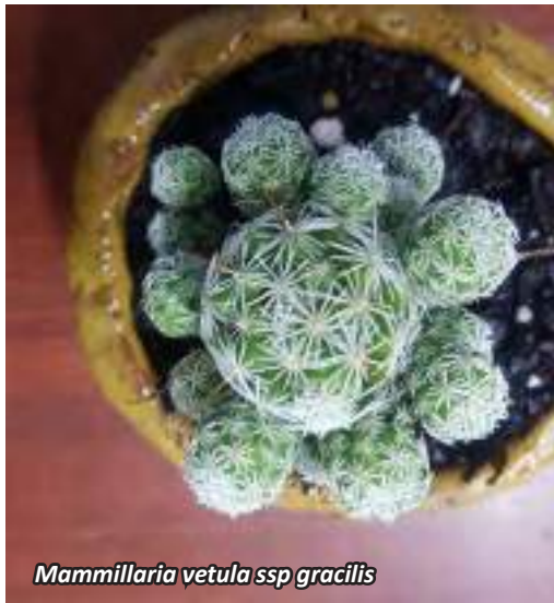
Mammillaria vetula ssp gracilis