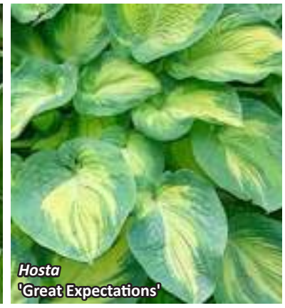
Hosta 'Great Expectations'