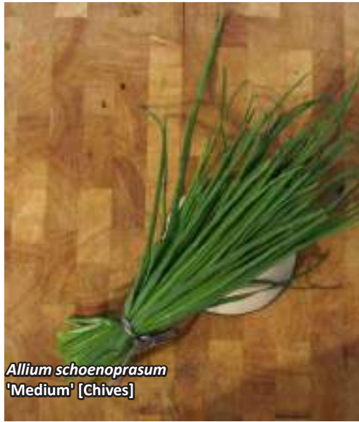
Allium schoenoprasum 'Medium' [Chives]