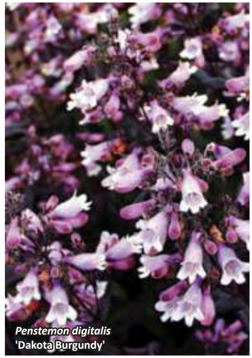
Penstemon digitalis 'Dakota Burgundy'