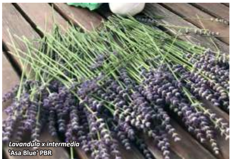
Lavandula x intermedia 'Asa Blue' PBR