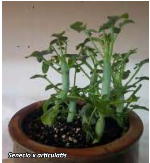
Senecio x articulatis