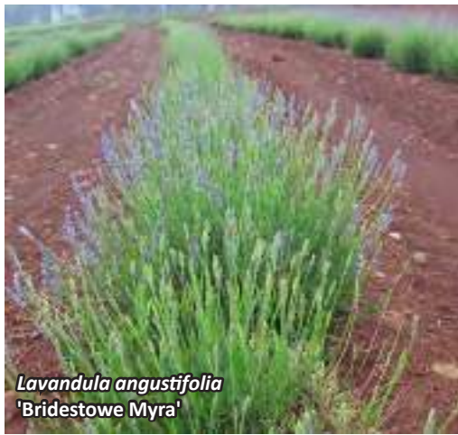
Lavandula angustifolia 'Bridestowe Myra'