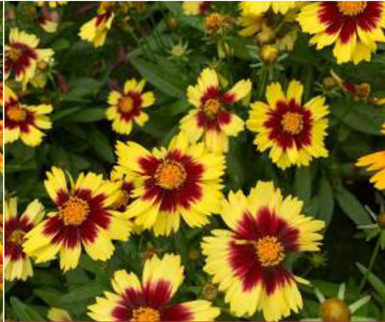
Coreopsis grandiflora 'Uptick Yellow Red'