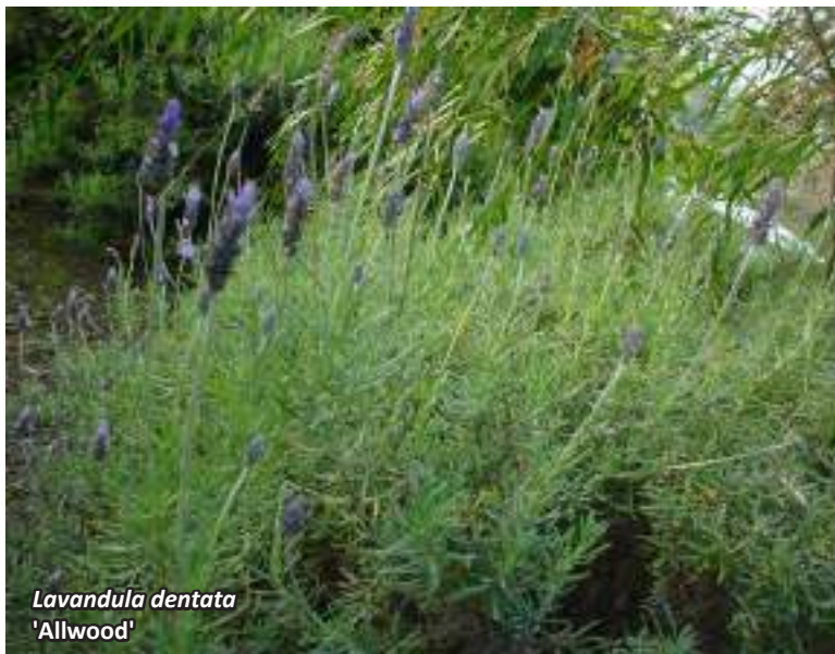
Lavandula dentata 'Allwood'