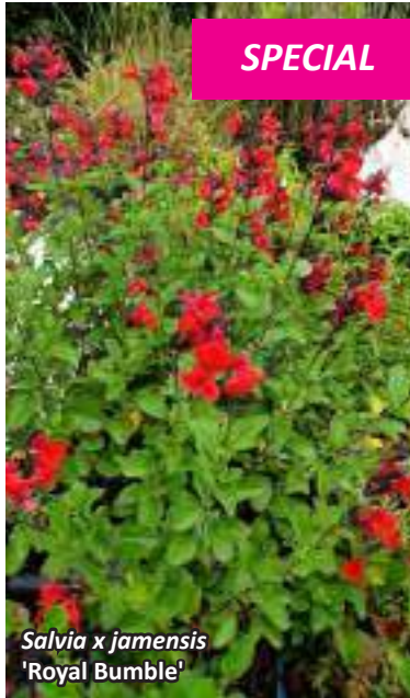
Salvia x jamensis 'Royal Bumble'