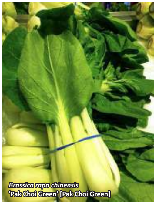
Brassica rapa chinensis 'Pak Choi Green' [Pak Choi Green]