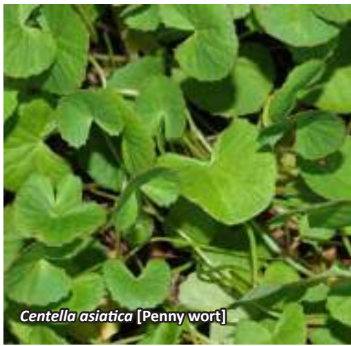
Centella asiatica [Penny wort]