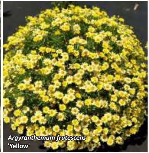
Argyranthemum frutescens 'Yellow'