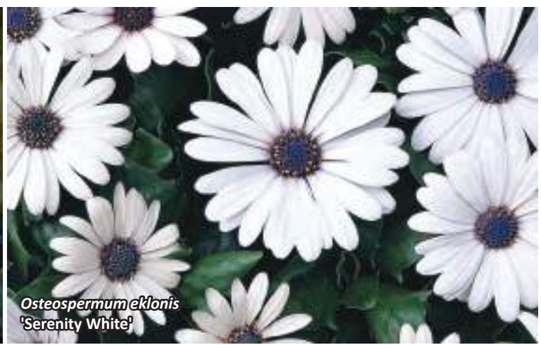
Osteospermum eklonis 'Serenity White'