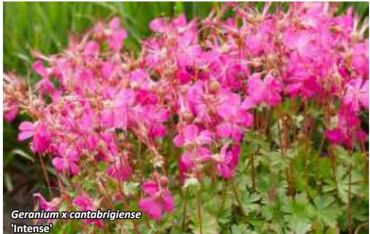
Geranium x cantabrigiense 'Intense'