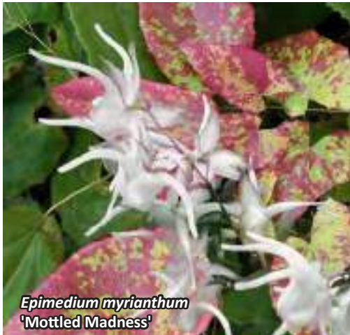
Epimedium myrianthum 'Mottled Madness'