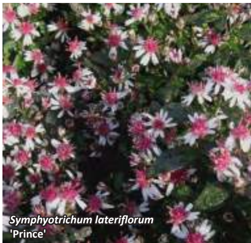
Symphotrichum lateriflorum 'Prince'