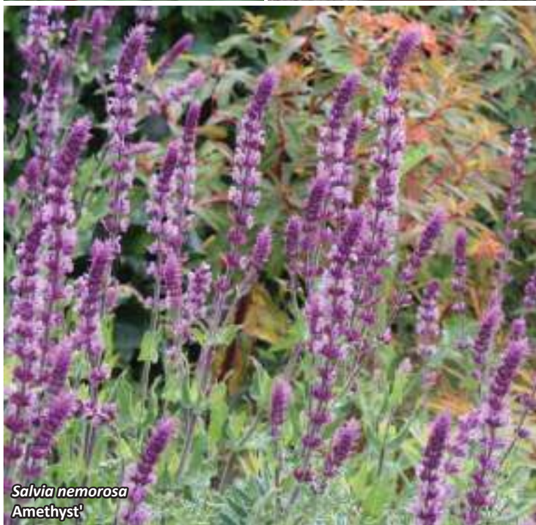
Salvia nemorosa 'Amethyst'