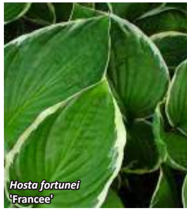
Hosta fortunei 'Francee'