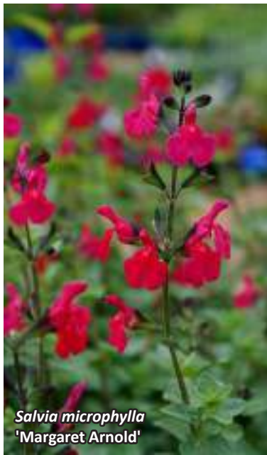
Salvia microphylla 'Margaret Arnold'