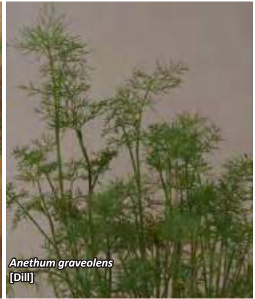
Anethum graveolens [Dill]