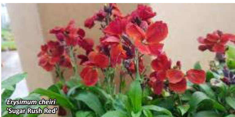
Erysimum cheiri 'Sugar Rush Red'