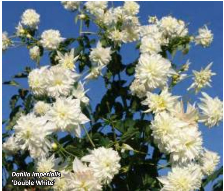
Dahlia imperialis 'Double White'