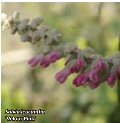
Salvia leucantha 'Velour Pink'