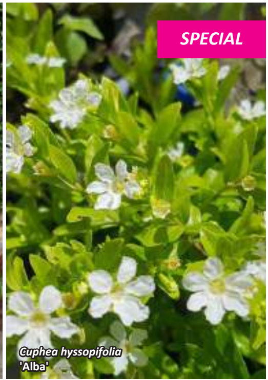
Cuphea hyssopifolia 'Alba'