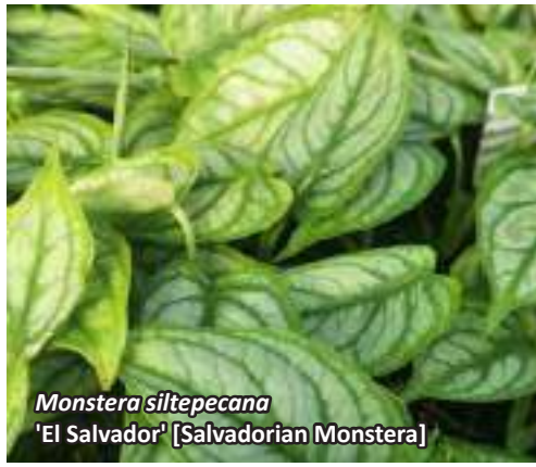
Monstera siltepecana 'El Salvador' [Salvadorian Monstera]