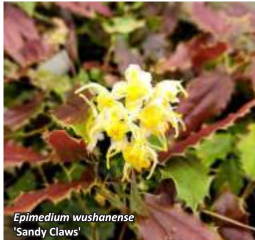
Epimedium wushanense 'Sandy Claws'