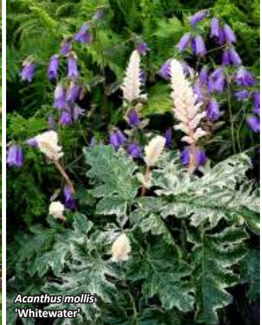
Acanthus mollis 'Whitewater'