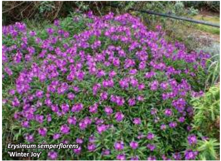
Erysimum semperflorens 'Winter Joy'