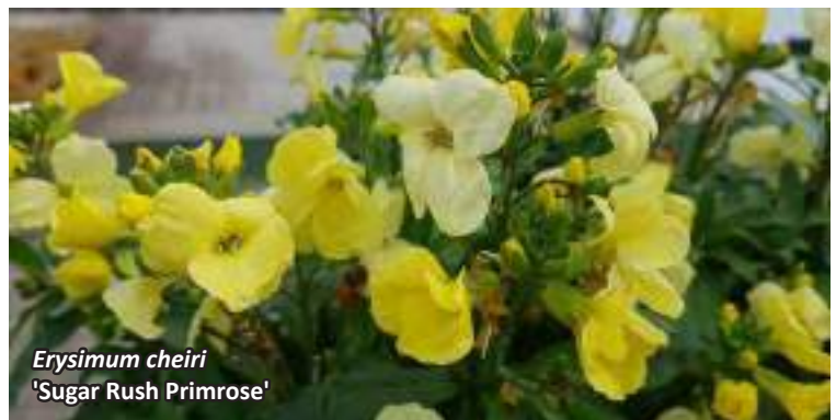
Erysimum cheiri 'Sugar Rush Primrose'