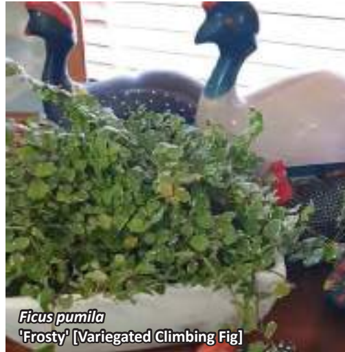
Ficus pumila 'Frosty' [Variegated Climbing Fig]