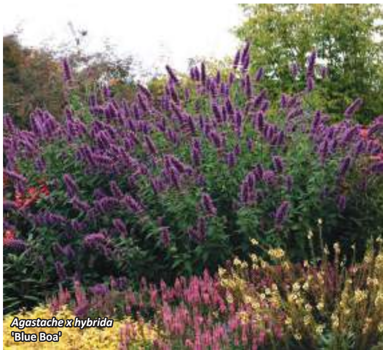
Agastache x hybrida 'Blue Boa'