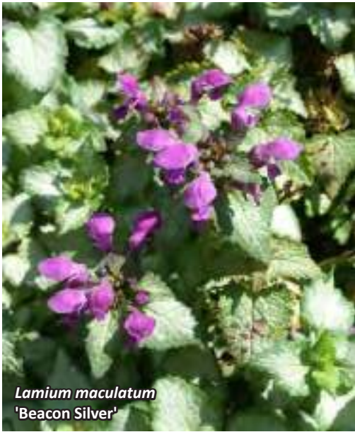
Lamium maculatum 'Beacon Silver'