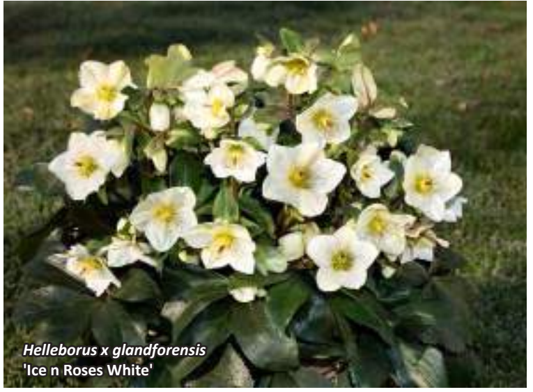
Helleborus x glandforensis 'Ice n Roses White'