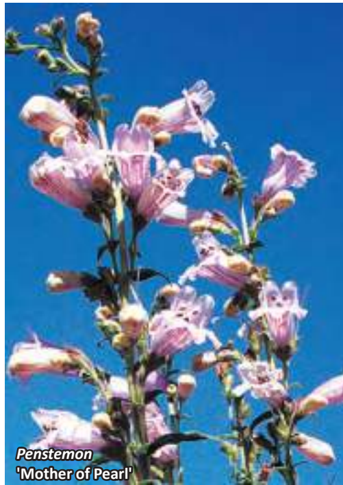
Penstemon 'Mother of Pearl'