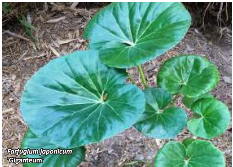
Farfugium japonicum 'Giganteum'