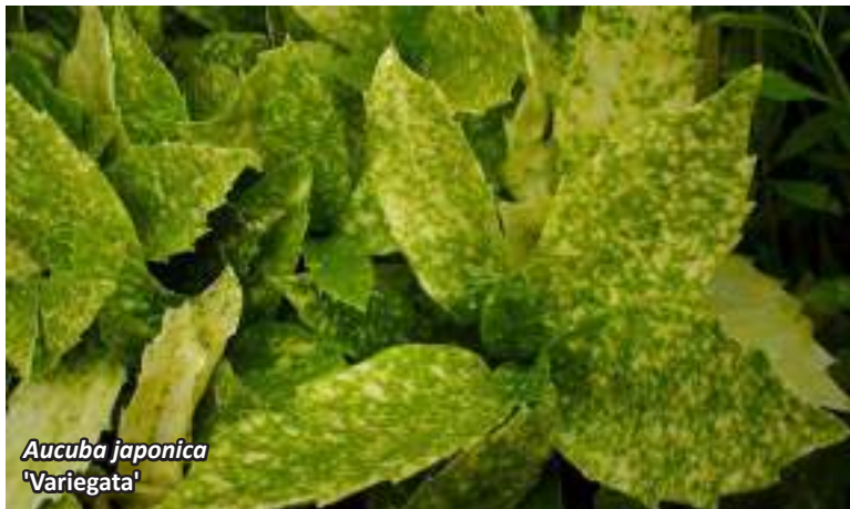
Aucuba japonica 'Variegata'