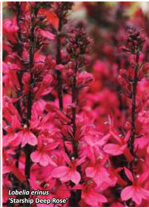
Lobelia erinus 'Starship Deep Rose'