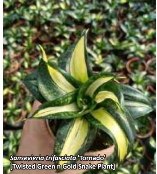
Sansevieria trifasciata 'Tornado' [Twisted Green n Gold Snake Plant]