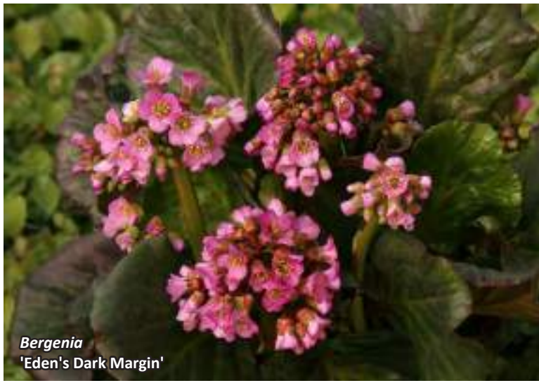
Bergenia 'Eden's Dark Margin'