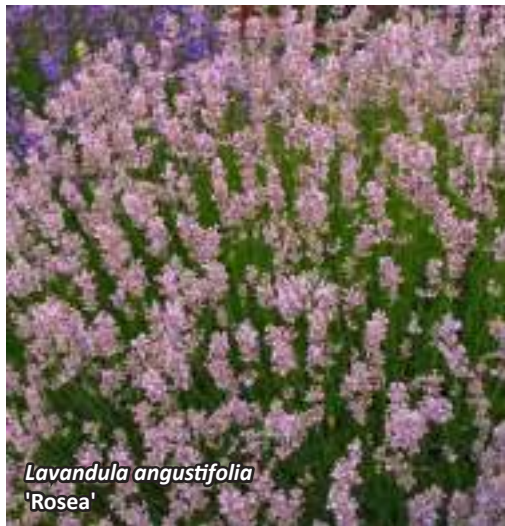
Lavandula angustifolia 'Rosea'