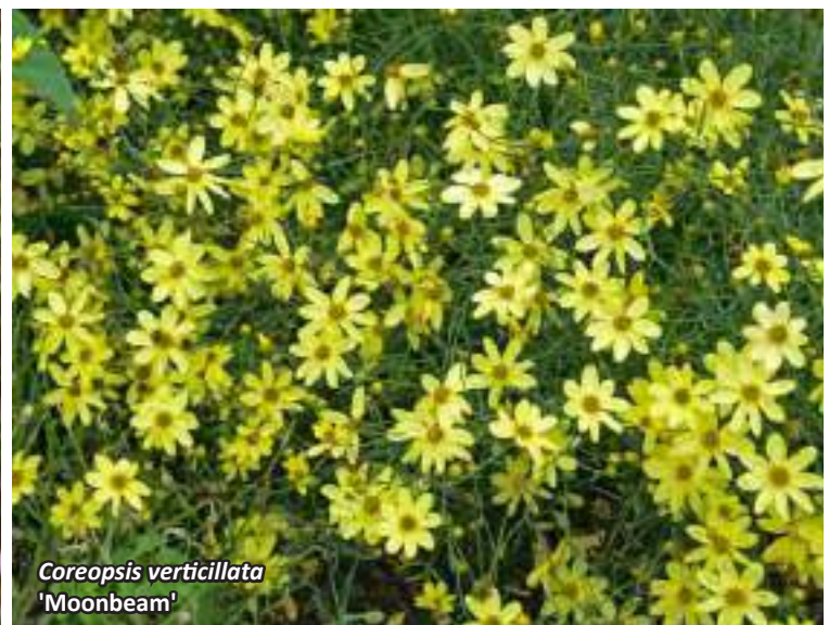
Coreopsis verticillata 'Moonbeam'