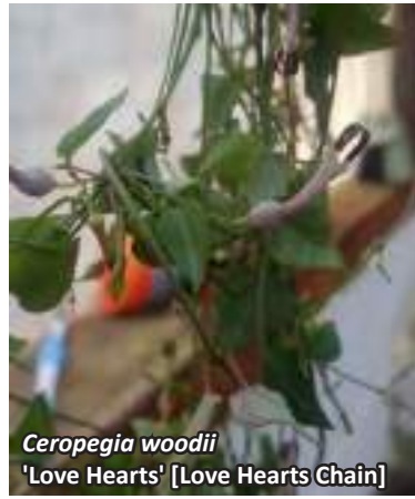
Ceropegia woodii 'Love Hearts' [Love Hearts Chain]