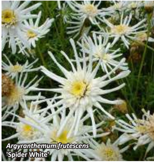
Argyranthemum frutescens 'Spider White'