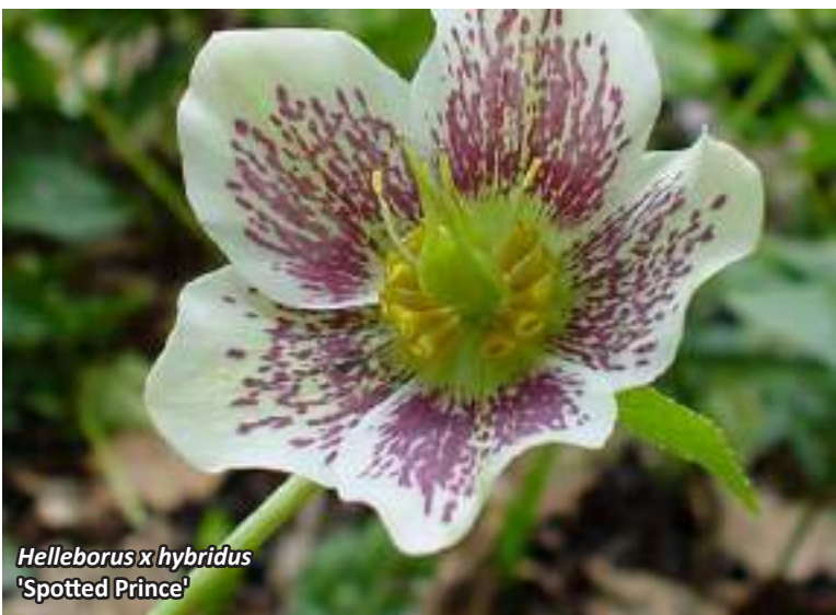
Helleborus x hybridus 'Spotted Prince'