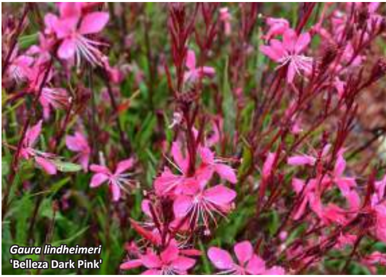
Gaura lindheimeri 'Belleza Dark Pink'