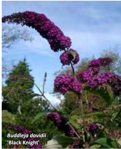
Buddleja davidii 'Black Knight'