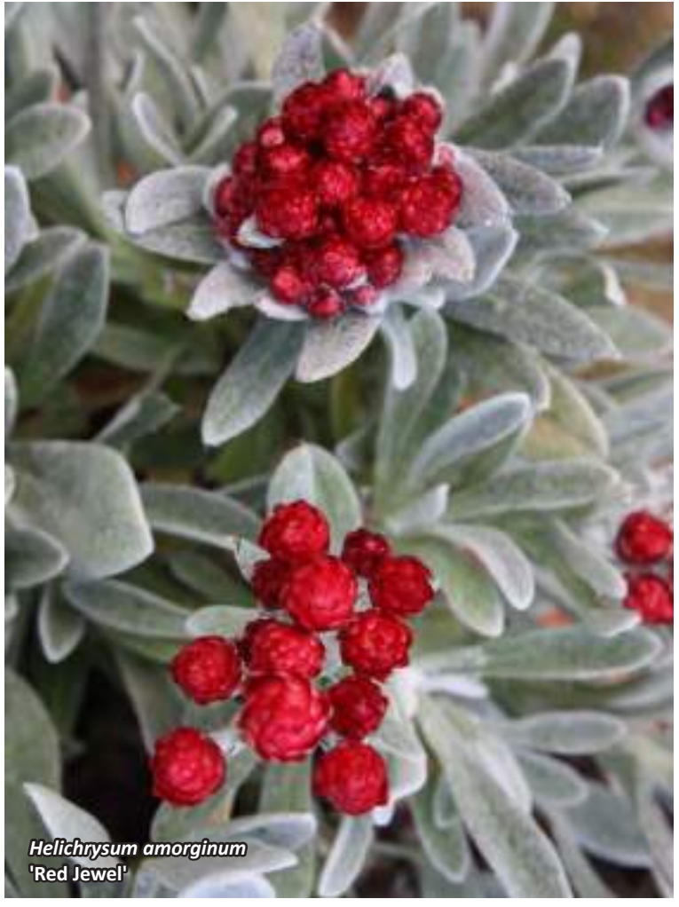
Helichrysum amorginum 'Red Jewel'