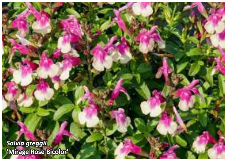
Salvia greggii 'Mirage Rose Bicolor'