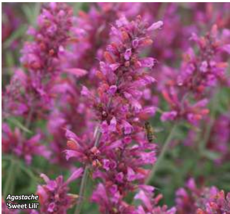
Agastache 'Sweet Lili'