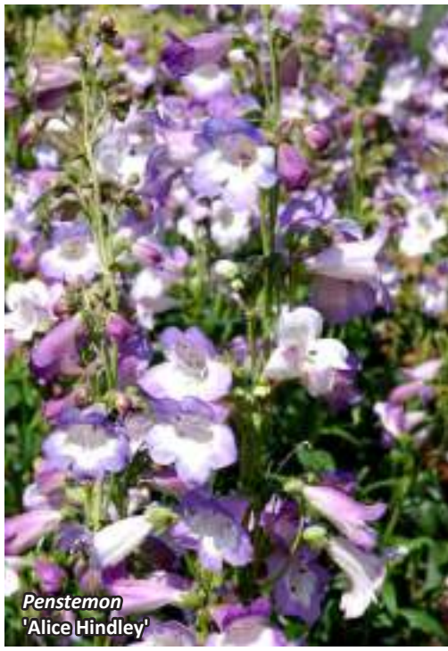
Penstemon 'Alice Hindley'