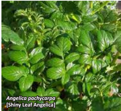
Angelica pachycarpa [Shiny Leaf Angelica]