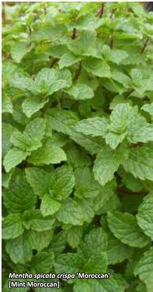
Mentha spicata crispata 'Moroccan' [Mint Moroccan]