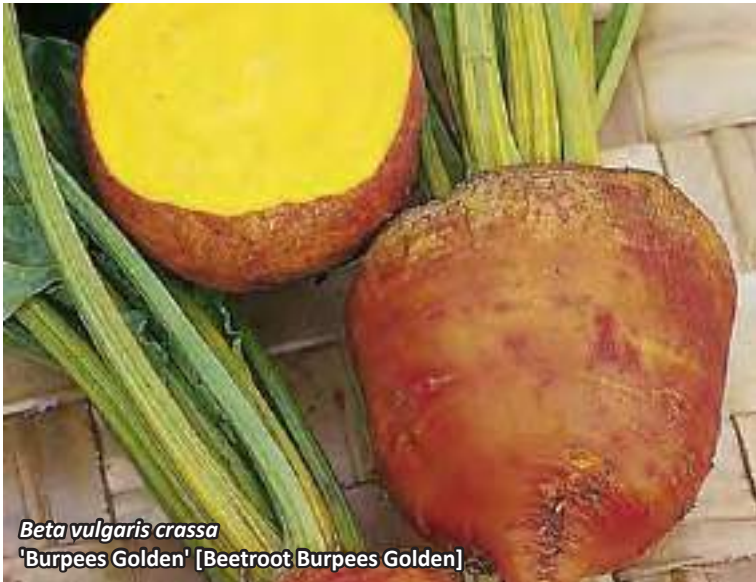
Beta vulgaris crassa 'Burpees Golden' [Beetroot Burpees Golden]