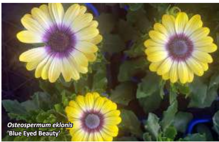
Osteospermum eklonis 'Blue Eyed Beauty'