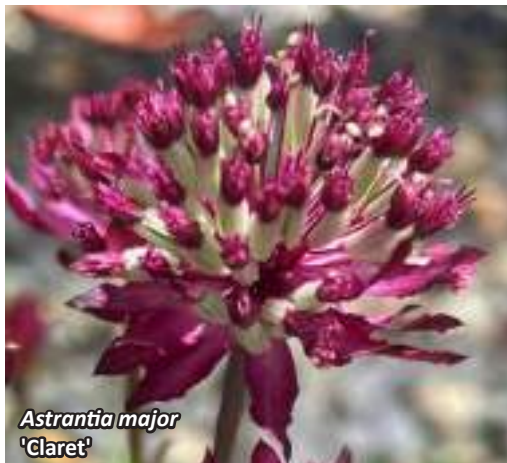
Astrantia major 'Claret'