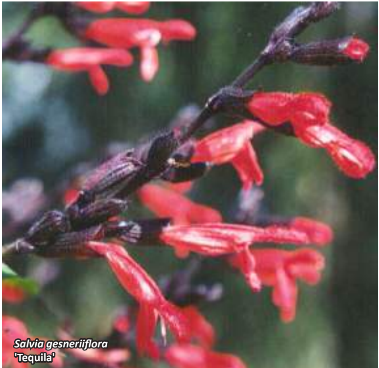
Salvia gesneriiflora 'Tequila'