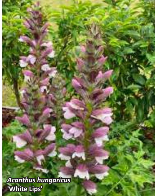
Acanthus hungaricus 'White Lips'