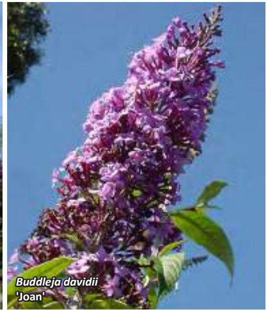
Buddleja davidii 'Joan'