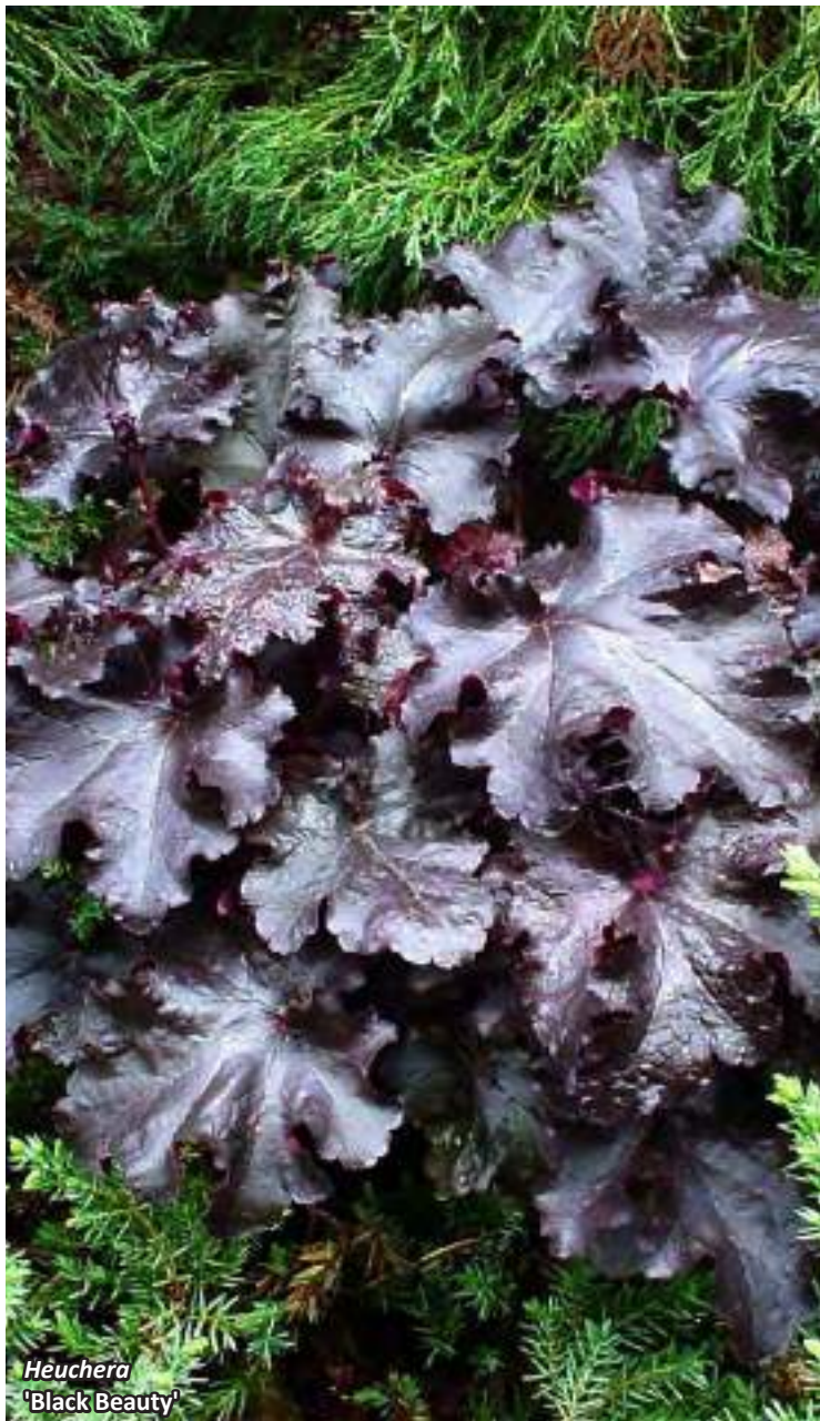
Heuchera 'Black Beauty'