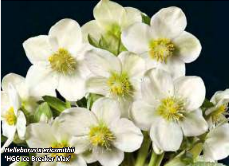
Helleborus x ericsmithii 'HGC Ice Breaker Max'