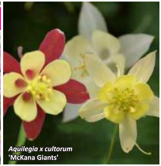
Aquilegia x cultorum 'McKana Giants'