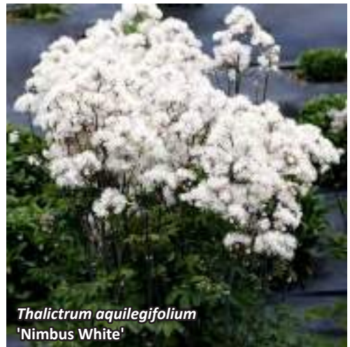
Thalictrum aquilegifolium 'Nimbus White'