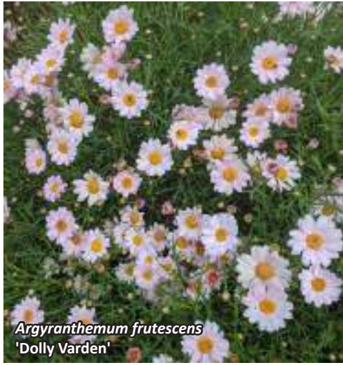
Argyranthemum frutescens 'Dolly Varden'