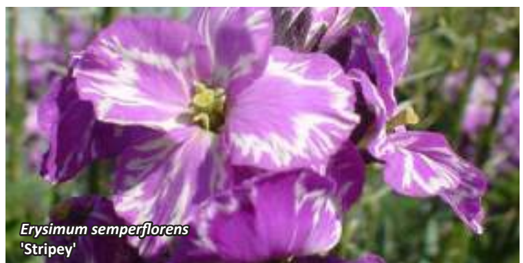
Erysimum semperflorens 'Stripey'