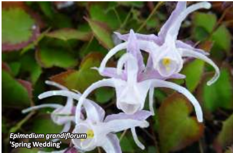
Epimedium grandiflorum 'Spring Wedding'