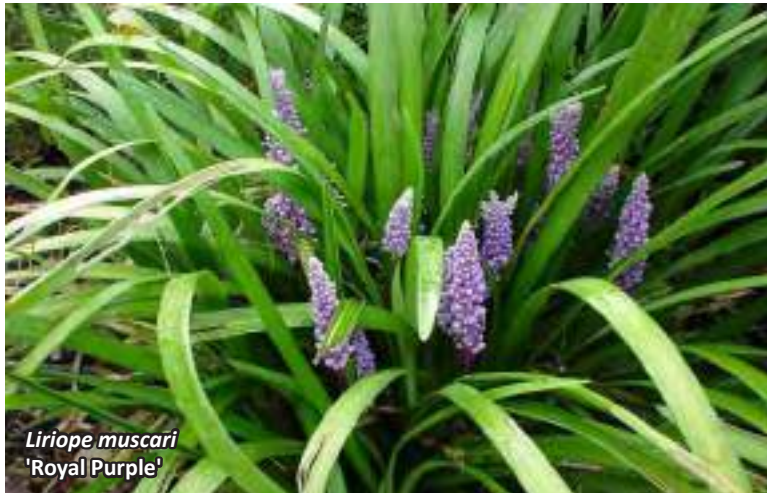
Liriope muscari 'Royal Purple'