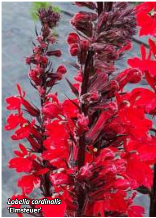
Lobelia cardinalis 'Elmsfeuer'