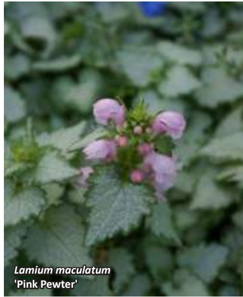
Lamium maculatum 'Pink Pewter'