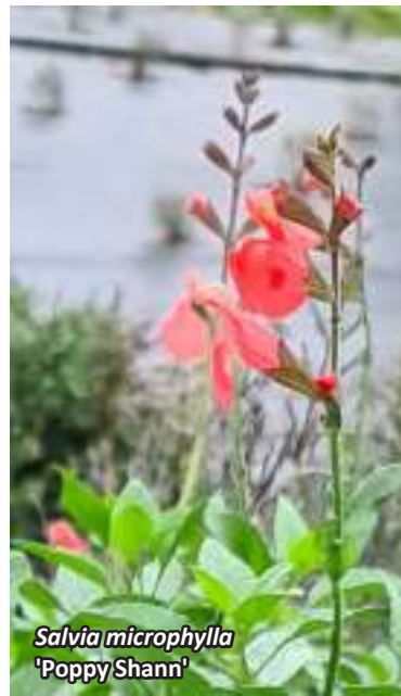
Salvia microphylla 'Poppy Shann'