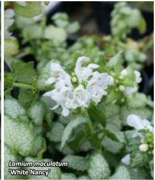
Lamium maculatum 'White Nancy'