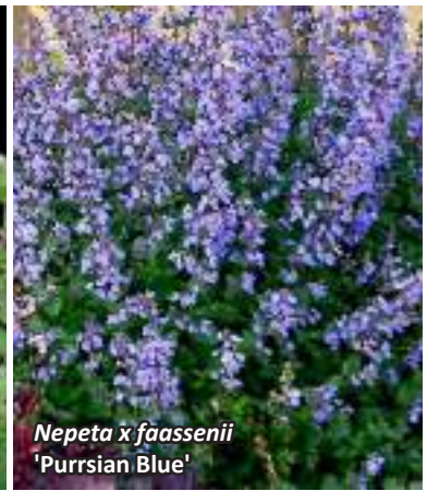
Nepeta x faassenii 'Purrsian Blue'