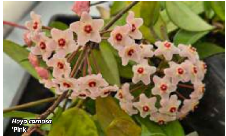
Hoya carnososa 'Pink'