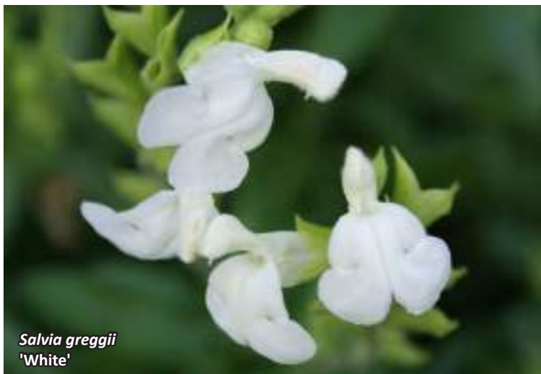
Salvia greggii 'White'