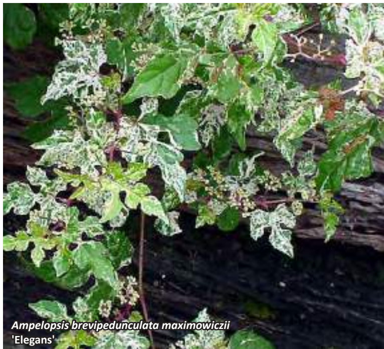
Ampelopsis brevipedunculata maximowiczii 'Elegans'