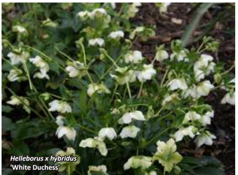
Helleborus x hybridus 'White Duchess'