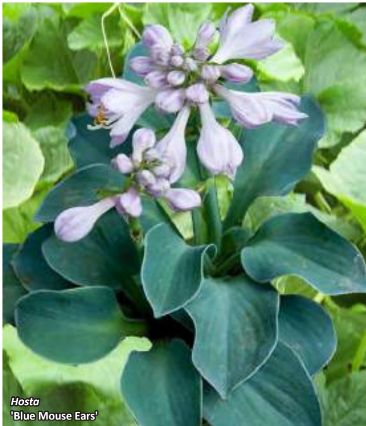
Hosta 'Blue Mouse Ears'