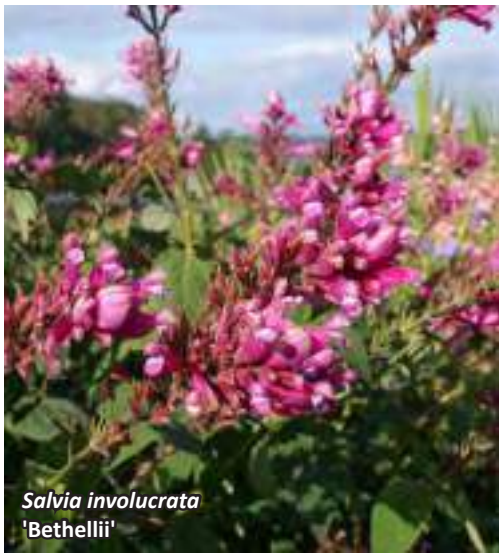
Salvia involucrata 'Bethellii'