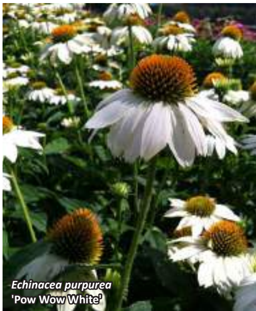
Echinacea purpurea 'Pow Wow White'