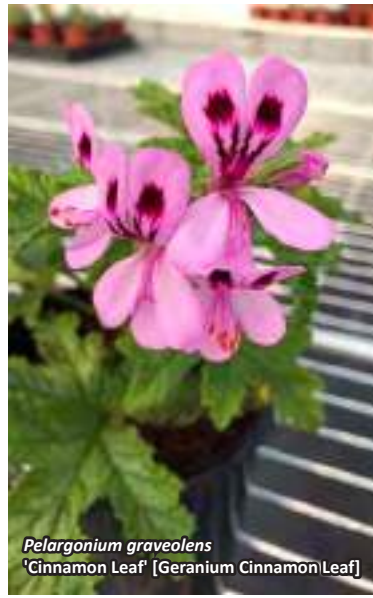
Pelargonium graveolens 'Cinnamon Leaf' [Geranium Cinnamon Leaf]