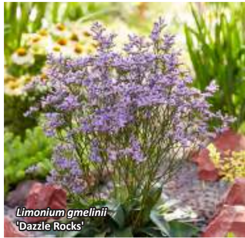
Limonium gmelinii 'Dazzle Rocks'