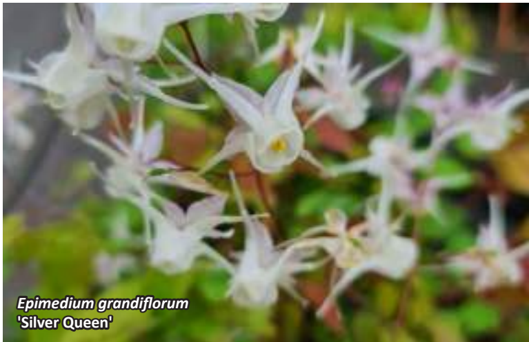
Epimedium grandiflorum 'Silver Queen'