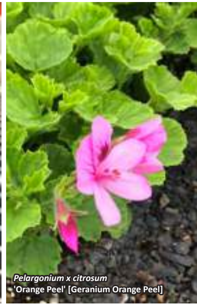
Pelargonium x citrosium 'Orange Peel' [Geranium Orange Peel]