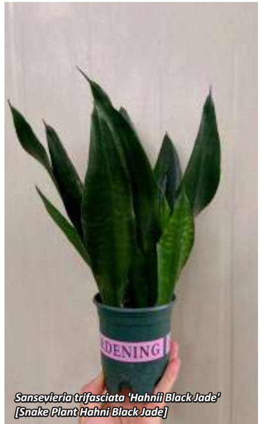
Sansevieria trifasciata 'Hahnii Black Jade' [Snake Plant Hahnii Black Jade]