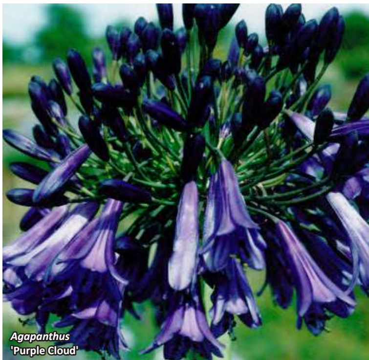
Agapanthus 'Purple Cloud'