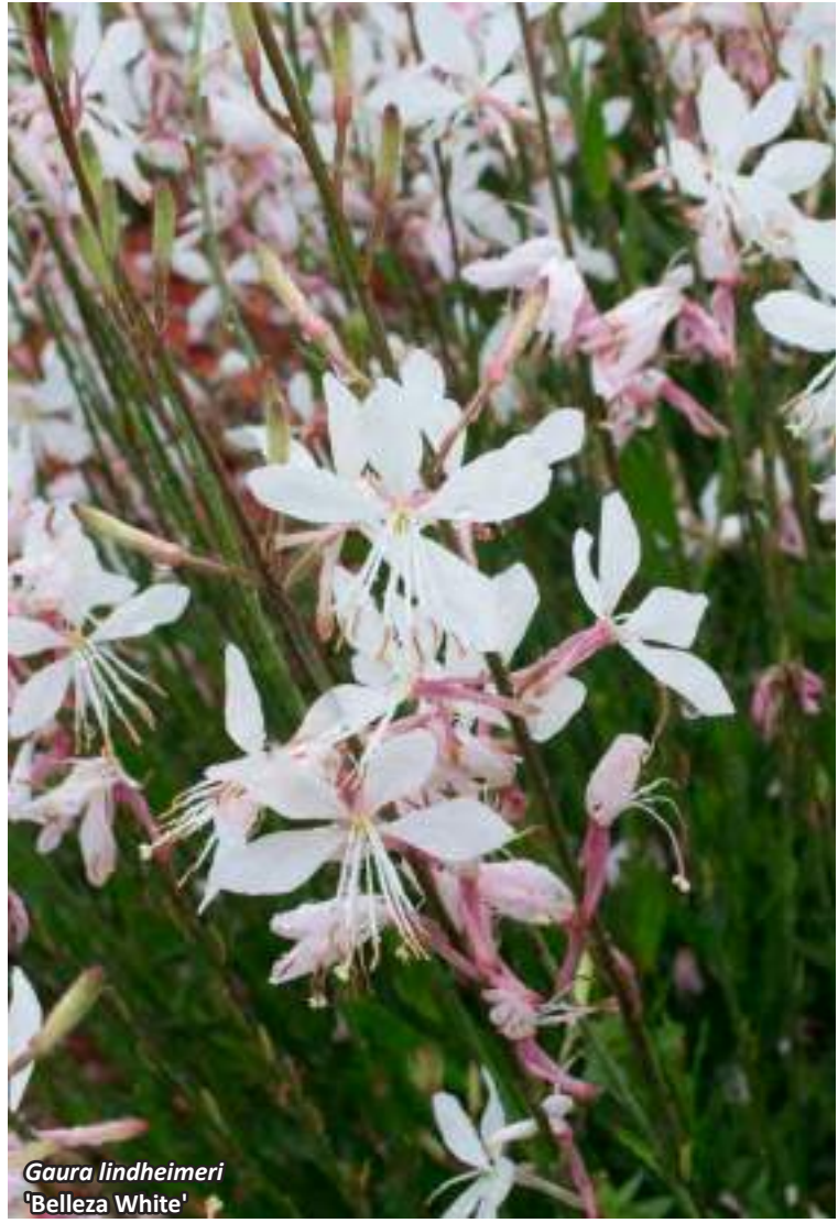
Gaura lindheimeri 'Belleza White'