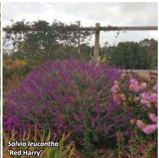
Salvia leucantha 'Red Harry'