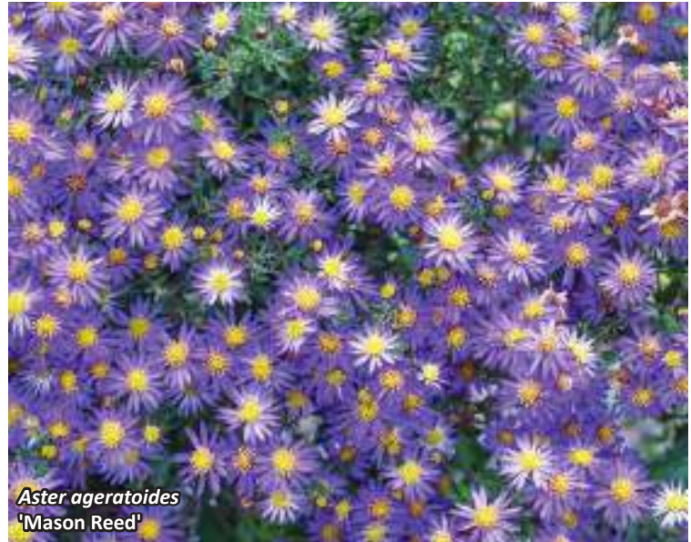
Aster ageratoides 'Mason Reed'