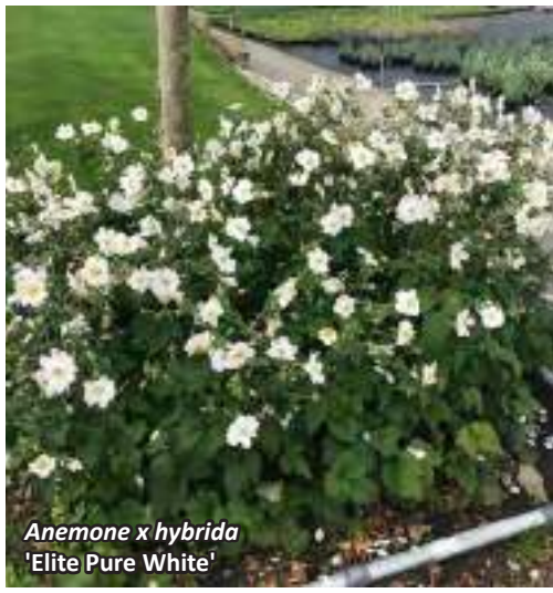
Anemone x hybrida 'Elite Pure White'