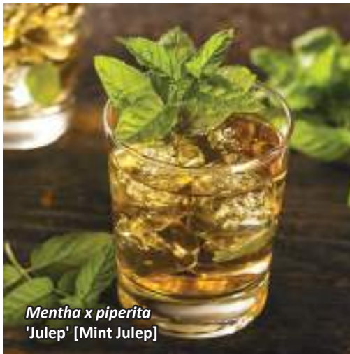
Mentha x piperita 'Julep' [Mint Julep]