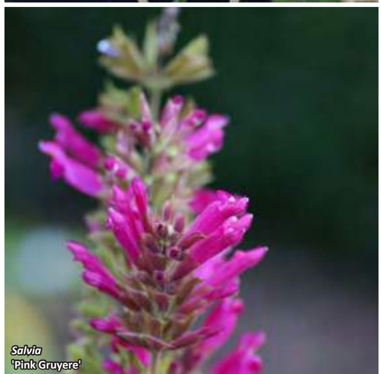
Salvia 'Pink Gruyere'