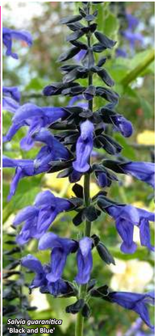
Salvia guaranitica 'Black and Blue'