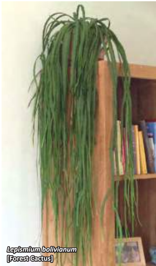
Lepismium bolivianum [Forest Cactus]