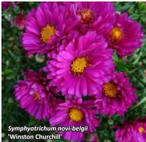
Symphotrichum novi-belgii 'Winston Churchill'