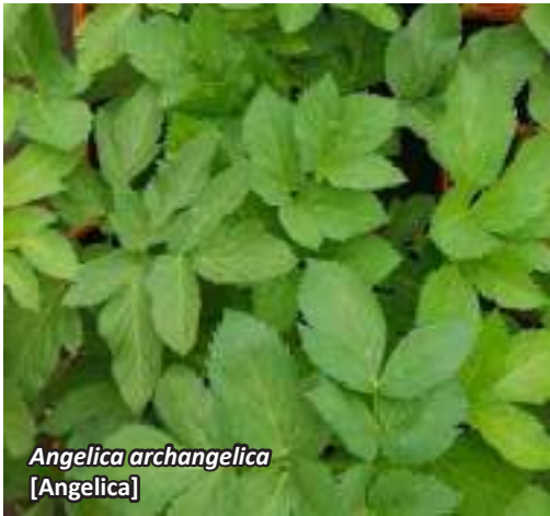
Angelica archangelica [Angelica]