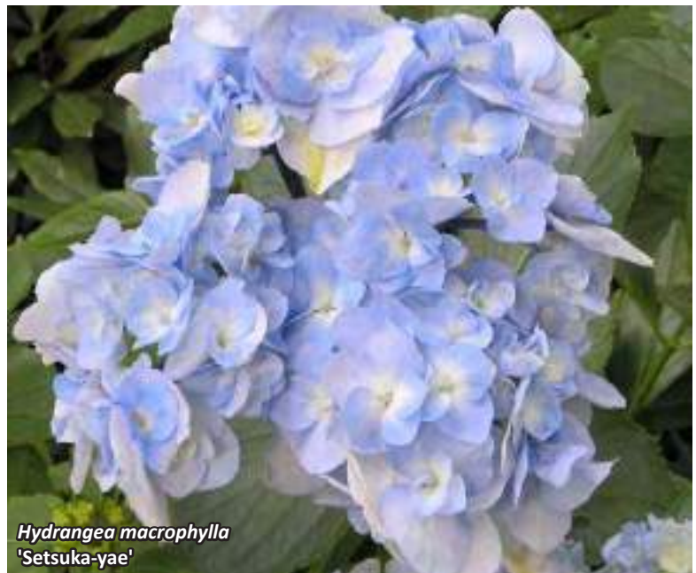
Hydrangea macrophylla 'Setsuka-yae'