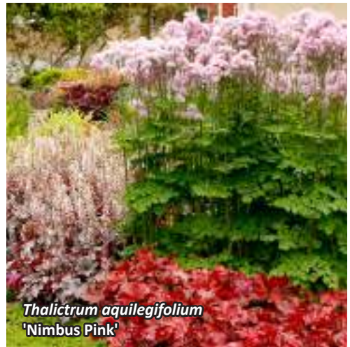
Thalictrum aquilegifolium 'Nimbus Pink'