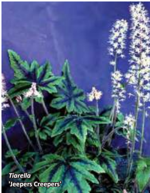
Tiarella 'Jeepers Creepers'