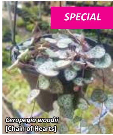
Ceropegia woodii [Chain of Hearts]