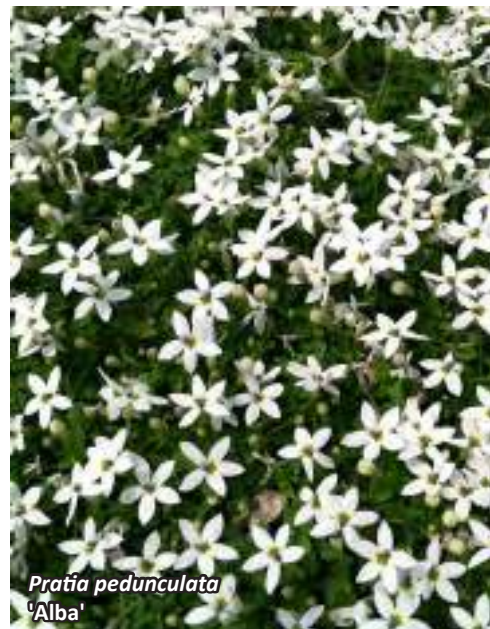
Pratia pedunculata 'Alba'