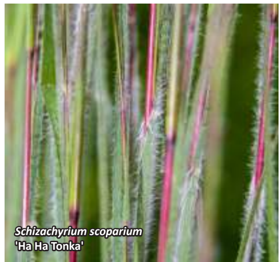
Schizachyrium scoparium 'Ha Ha Tonka'