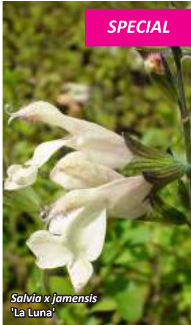
Salvia x jamensis 'La Luna'