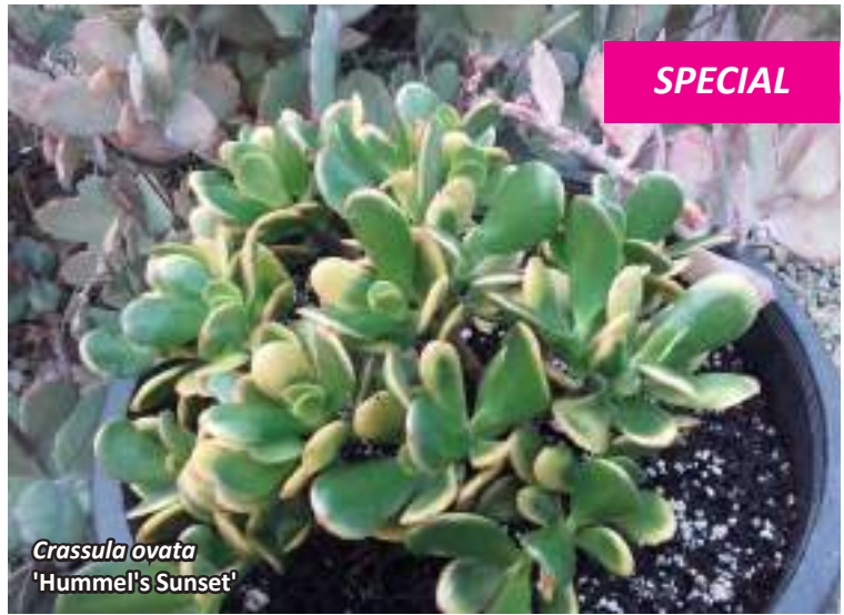
Crassula ovata 'Hummel's Sunset'