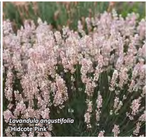
Lavandula angustifolia 'Hidcote Pink'