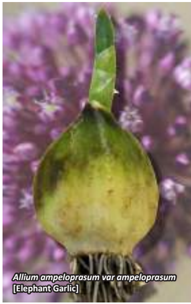
Allium ampeloprasum var ampeloprasum [Elephant Garlic]