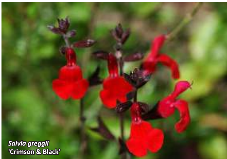
Salvia greggii 'Crimson & Black'