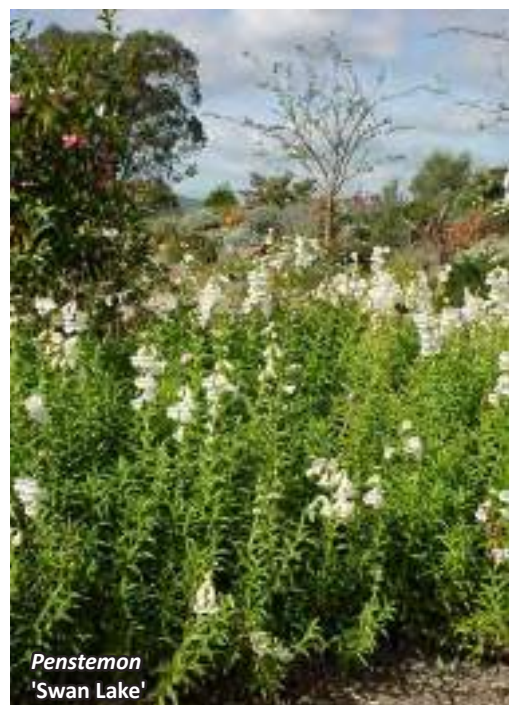
Penstemon 'Swan Lake'