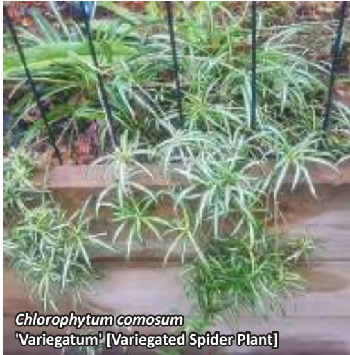
Chlorophytum comosum 'Variegatum' [Variegated Spider Plant]