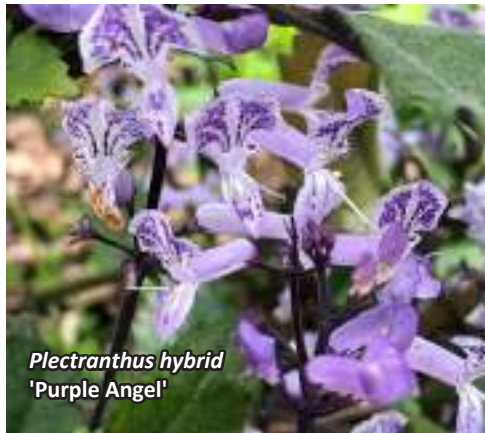
Plectranthus hybrid 'Purple Angel'