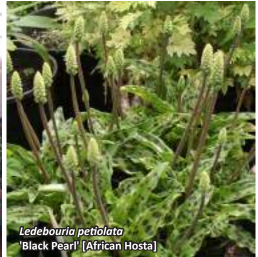
Ledebouria petiolata 'Black Pearl' [African Hosta]