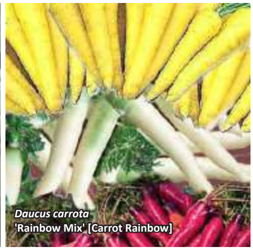
Daucus carota 'Rainbow Mix' [Carrot Rainbow]