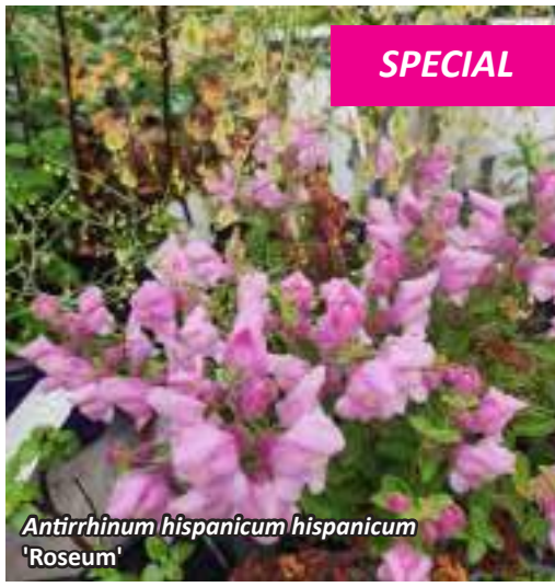
Antirrhinum hispanicum hispanicum 'Roseum'