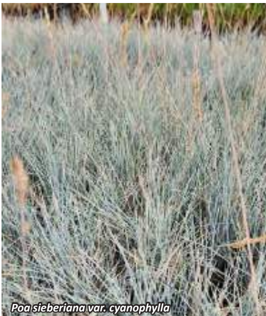
Poa sieberiana var. cyanophylla