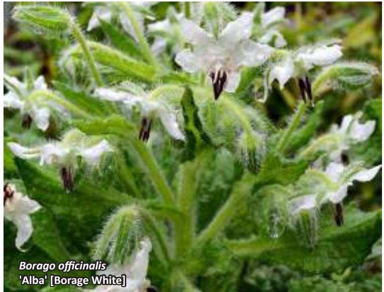
Borago officinalis 'Alba' [Borage White]