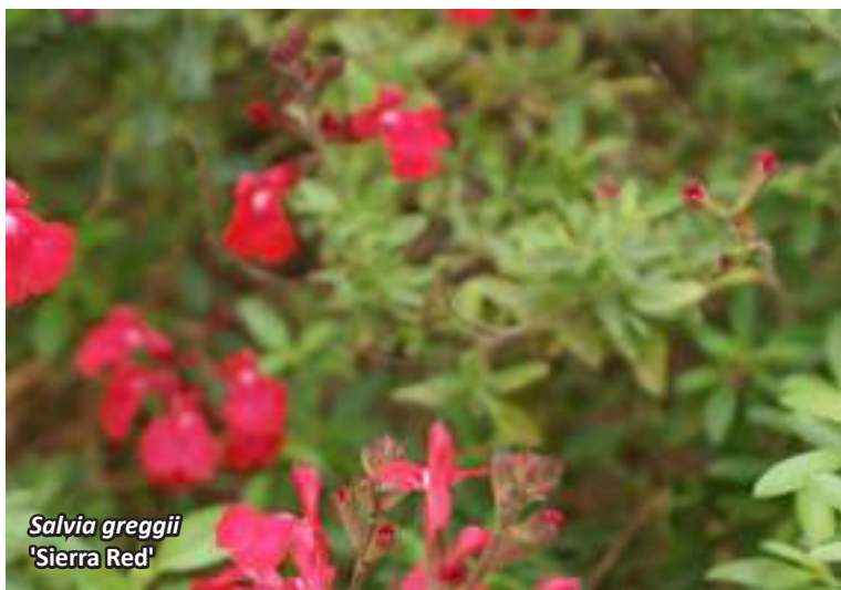
Salvia greggii 'Sierra Red'