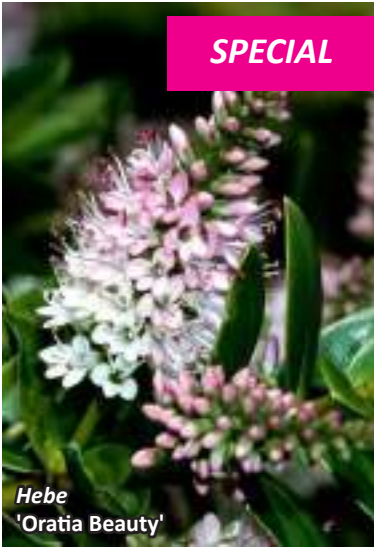
Hebe 'Oratia Beauty'