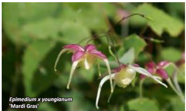
Epimedium x youngianum 'Mardi Gras'