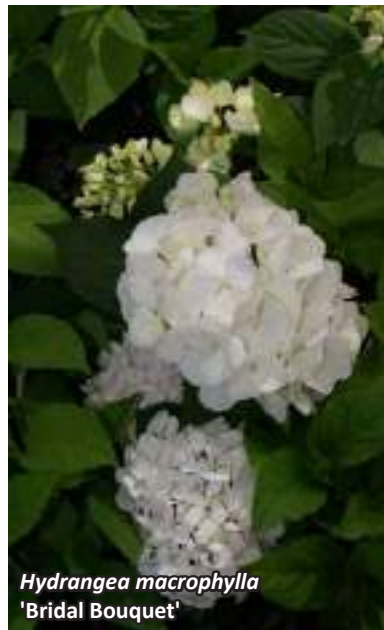
Hydrangea macrophylla 'Bridal Bouquet'