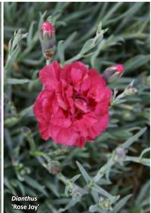
Dianthus 'Rose Joy'