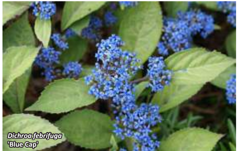
Dichroa febrifuga 'Blue Cap'