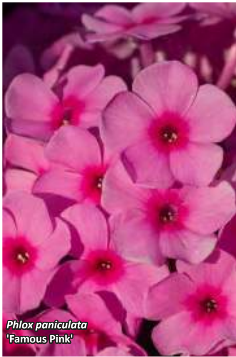
Phlox paniculata 'Famous Pink'