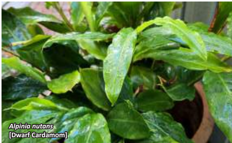
Alpinia nutans [Dwarf Cardamom]