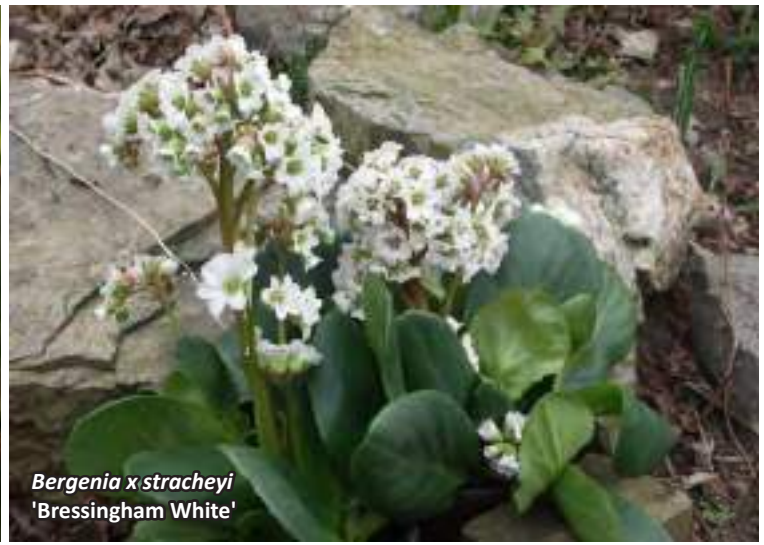
Bergenia x stracheyi 'Bressingham White'