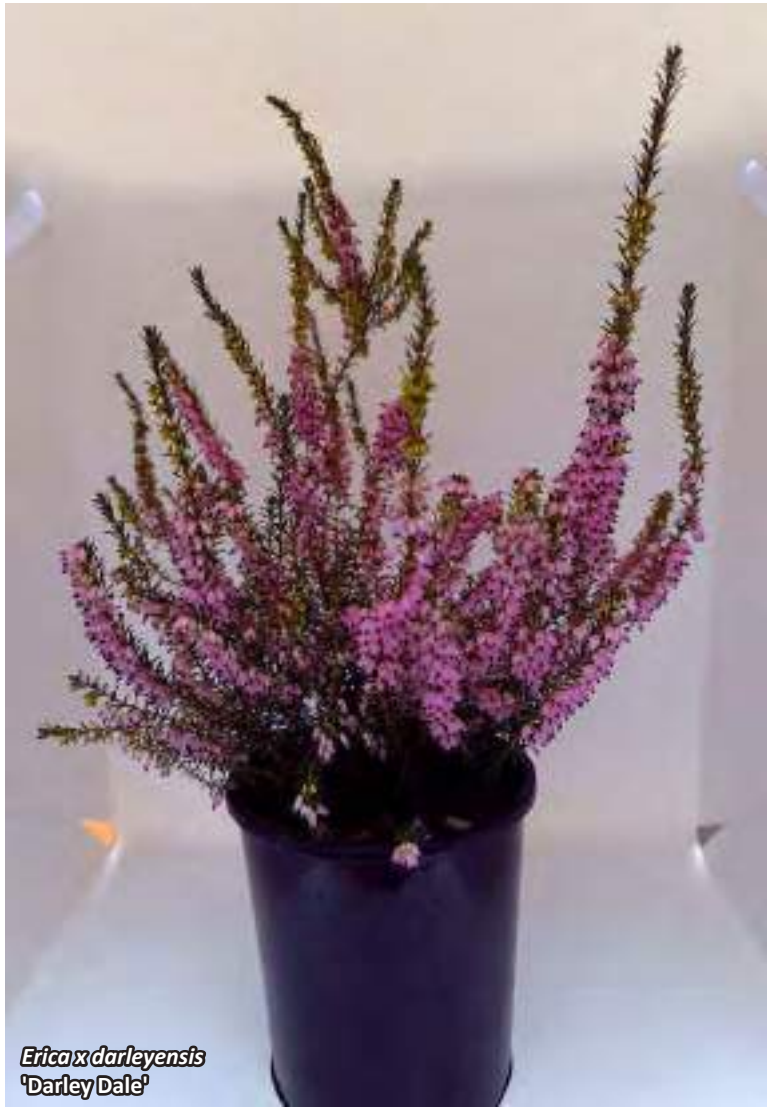
Erica x darleyensis 'Darley Dale'