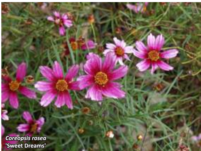
Coreopsis rosea 'Sweet Dreams'