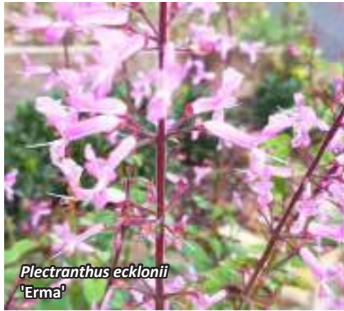
Plectranthus ecklonii 'Erma'