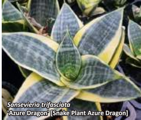
Sansevieria trifasciata 'Azure Dragon' [Snake Plant Azure Dragon]