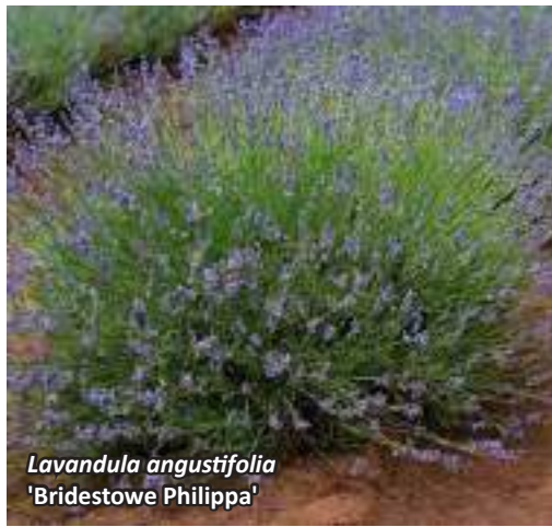
Lavandula angustifolia 'Bridestowe Philippa'