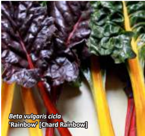
Beta vulgaris cicla 'Rainbow' [Chard Rainbow]