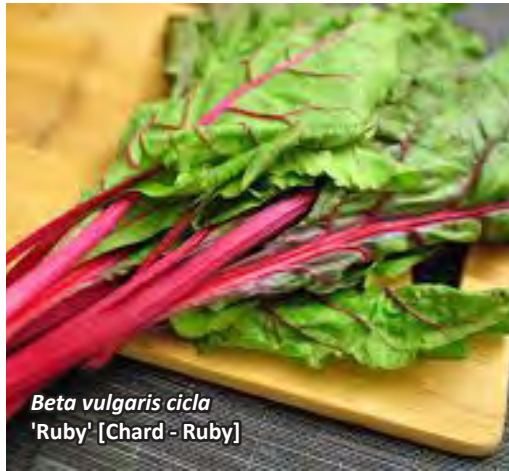
Beta vulgaris cicla 'Ruby' [Chard - Ruby]