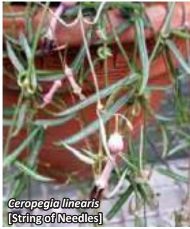
Ceropegia linearis [String of Needles]