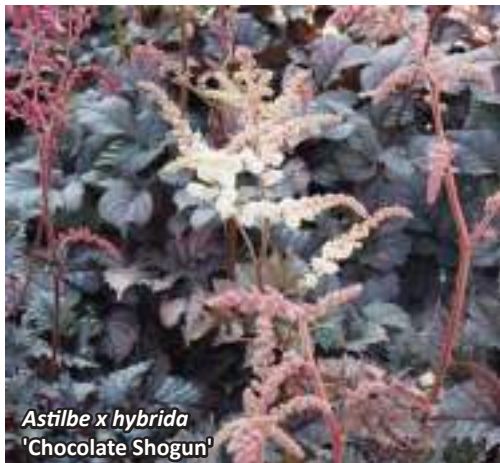
Astilbe x hybrida 'Chocolate Shogun'