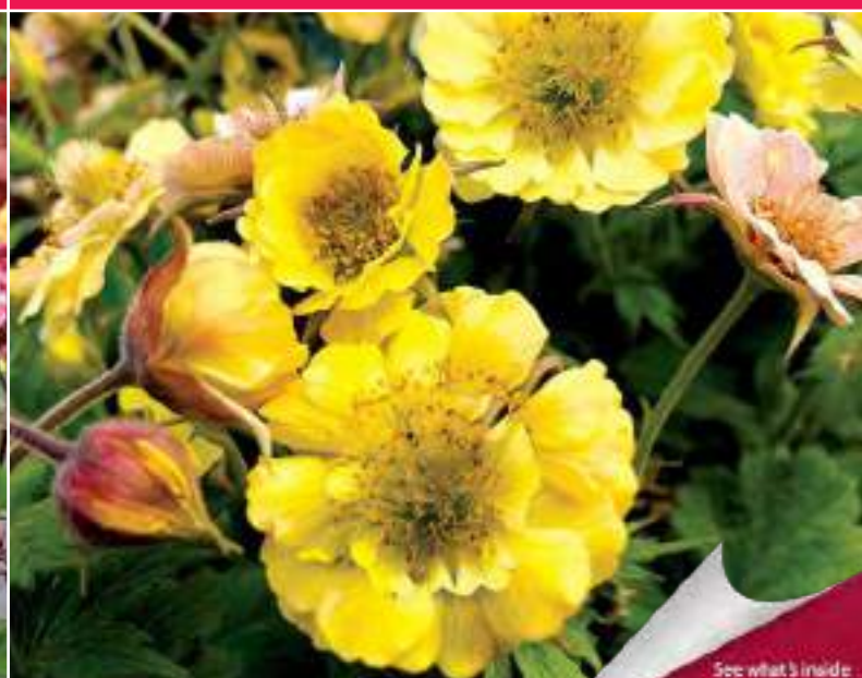
Geum 'Tempo Yellow'