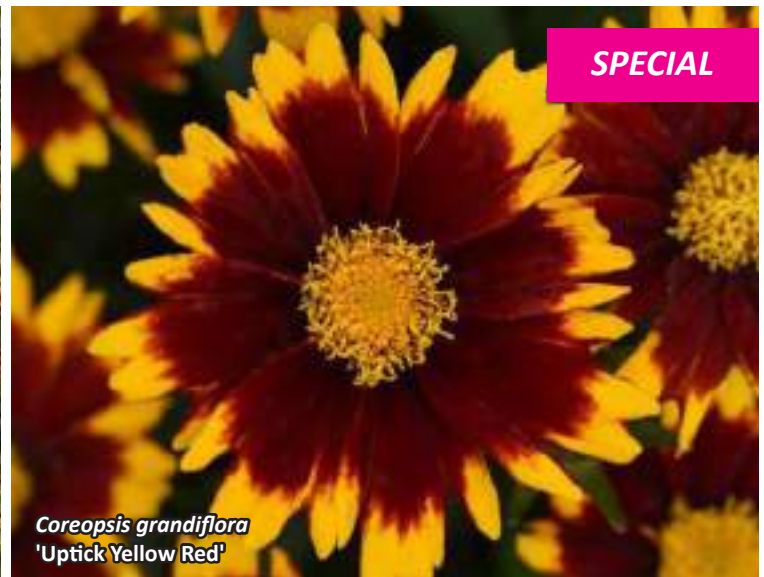
Coreopsis grandiflora 'Uptick Yellow Red'