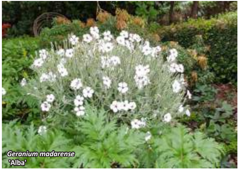
Geranium madarense 'Alba'