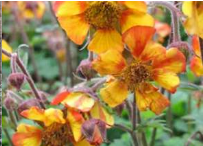
Geum rivale 'Norgate's Flame'