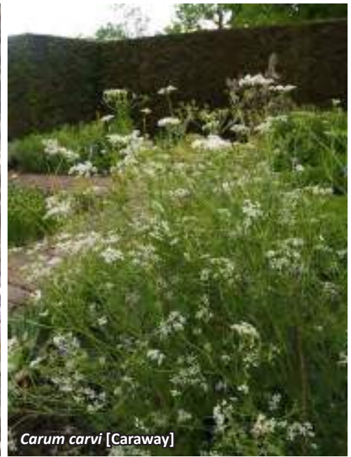
Carum carvi [Caraway]