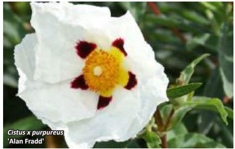
Cistus x purpureus 'Alan Fradd'