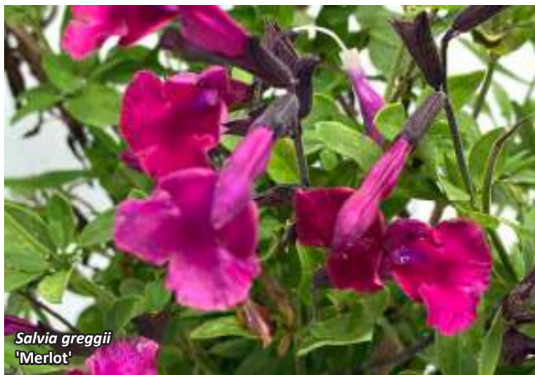
Salvia greggii 'Merlot'