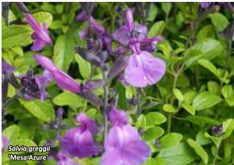
Salvia greggii 'Mesa Azure'