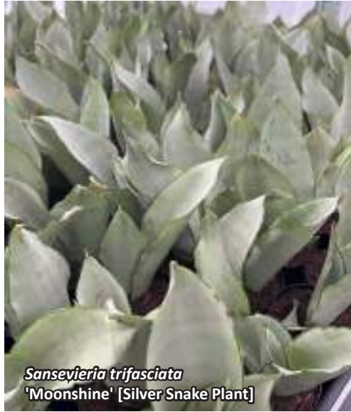
Sansevieria trifasciata 'Moonshine' [Silver Snake Plant]