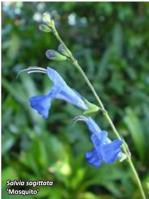
Salvia sagittata 'Mosquito'