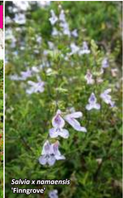
Salvia x namaensis 'Finn Grove'