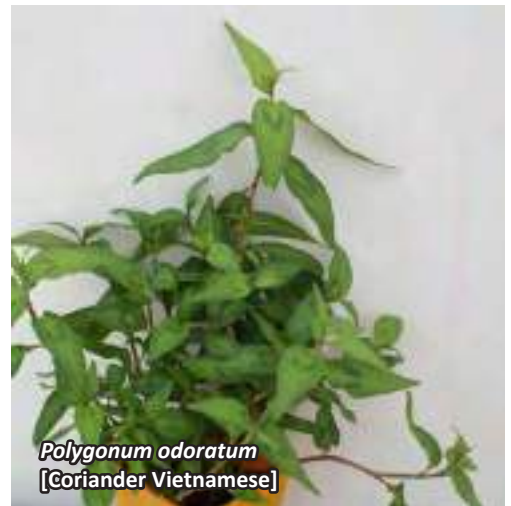
Polygonum odoratum [Coriander Vietnamese]