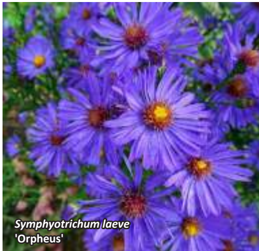
Symphotrichum laeve 'Orpheus'