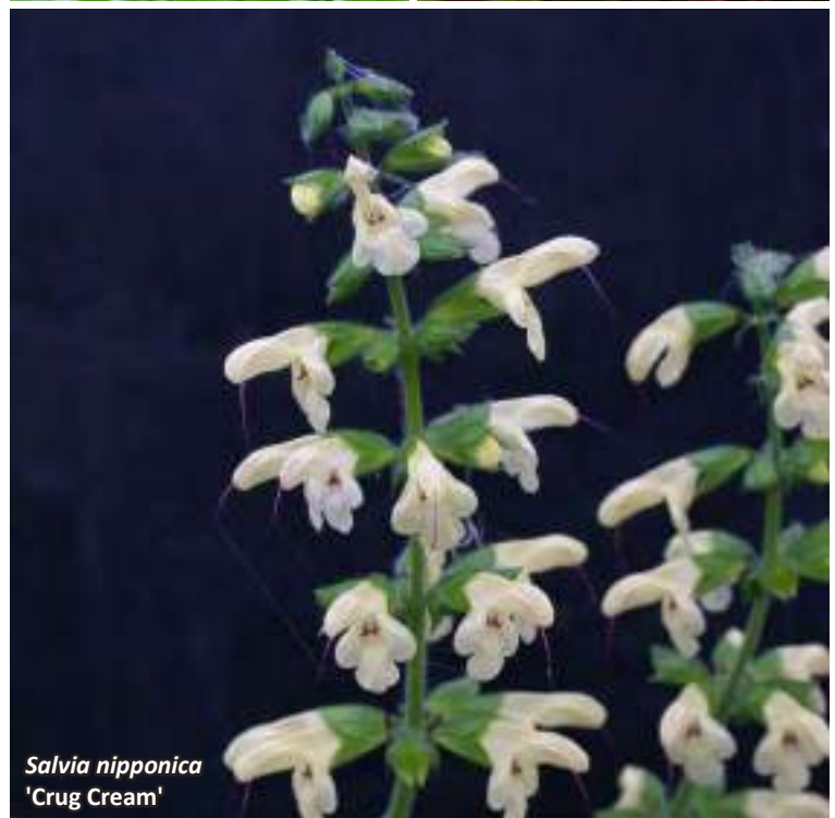
Salvia nipponica 'Crug Cream'