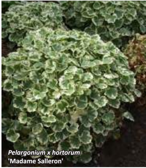
Pelargonium x hortorum 'Madame Salleron'