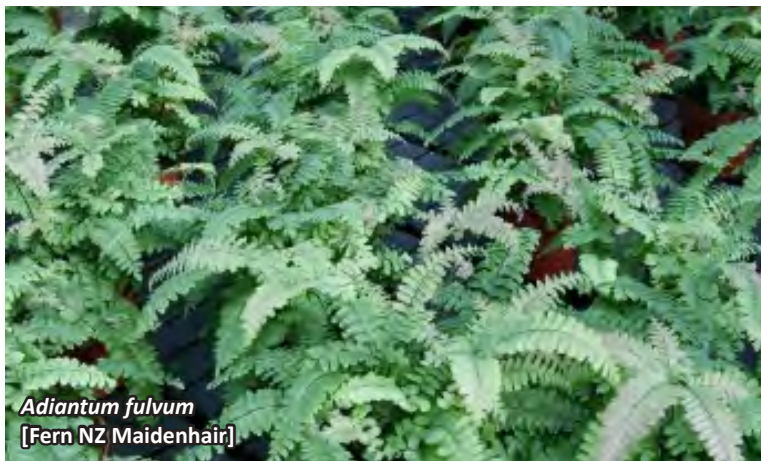
Adiantum fulvum [Fern NZ Maidenhair]