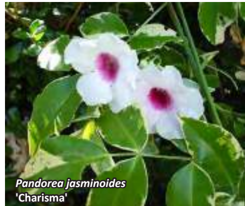
Pandorea jasminoides 'Charisma'