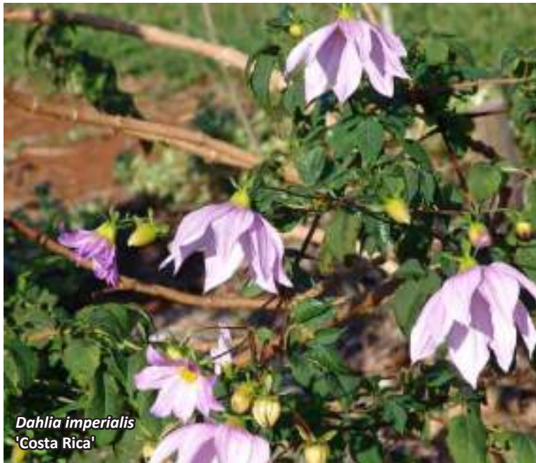
Dahlia imperialis 'Costa Rica'