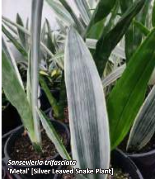
Sansevieria trifasciata 'Metal' [Silver Leaved Snake Plant]