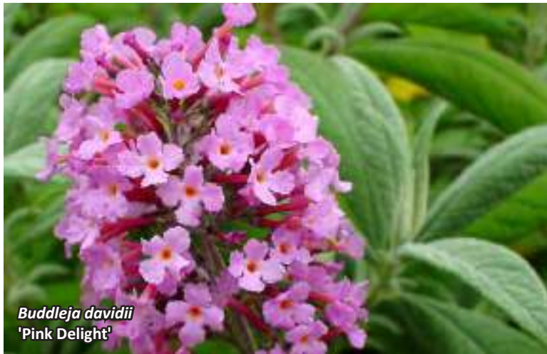
Buddleja davidii 'Pink Delight'